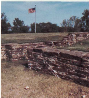
First Fort Smith ruins.