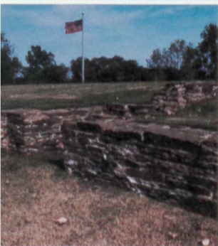
First Fort Smith ruins.