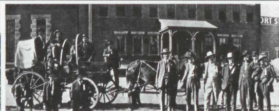
Some of the men who rode for Parker—U.S. deputy marshals at Fort Smith. "Without these men," Parker said, "I could not hold court a single day." Theirs was a perilous job, and Parker