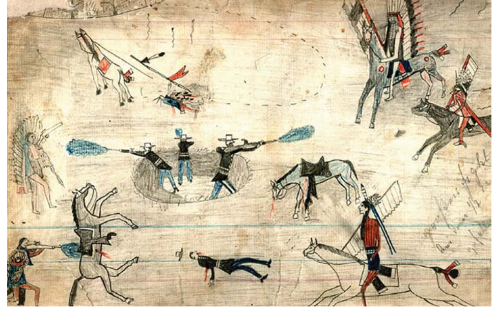
Kiowa ledger of Buffalo Wallow battle