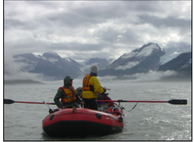
A float trip down the Alsek River is an unforgettable journey through one of the world's wildest and most beautiful areas.

The Park Service participates in a unified cooperative effort with Canadian partners in preserving the wild pristine character of the river and integrity of the river experience.