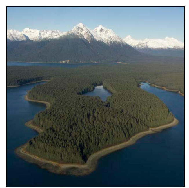
The northern Beardslee Islands and Beartrack Mountains of lower Glacier Bay exemplify the park's diversity of relatively pristine ecosystems that are dominated by natural processes.

The park recognizes that past Tlingit interactions with the landscape were compatible with preservation of an intact ecosystem worthy of designation as a national park.