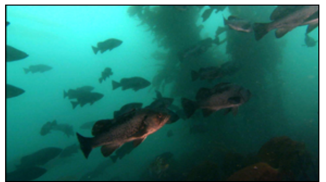
Highly productive kelp forests provide shelter for a myriad of marine species within the protected waters of Glacier Bay.

• Diverse Fisheries Management The park's marine fisheries management regimes range from essentially no-take, to select activities with limited participation and a sunset clause, to areas open to all state-authorized activities. This diversity allows managers to observe the ecological and economic/cultural impacts and consequences of various approaches; the benefits of this information may reach beyond the park.