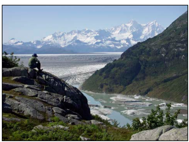
Glacier Bay offers opportunities for human solitude and a remote wildness that is rapidly disappearing in today's world.

The park's designated wilderness provides opportunities for natural and sociological scientific investigation of wilderness ecosystems and values.