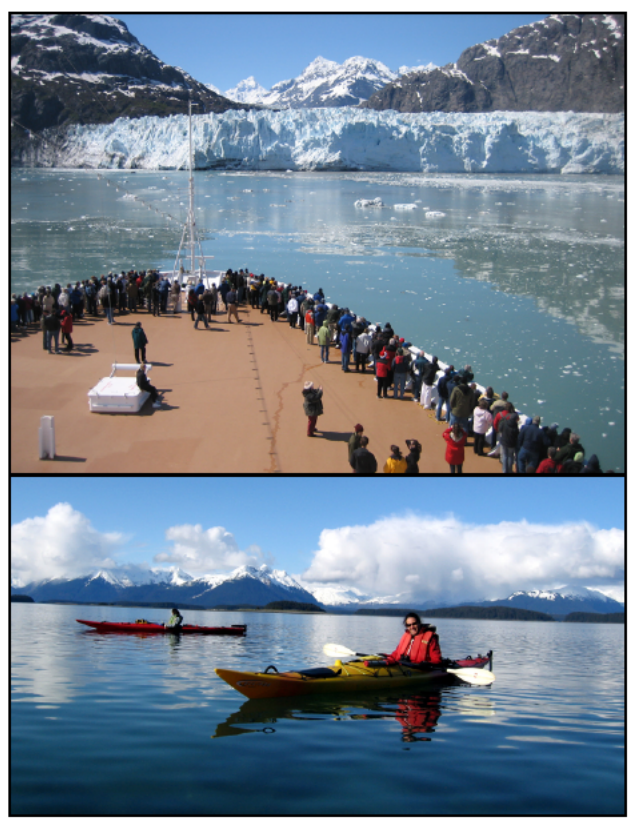
There are many different ways to enjoy the wonders of Glacier Bay National Park and Preserve.

The park provides visitors the opportunity to experience Tlingit culture through a variety of media and to interact directly with Tlingit people.