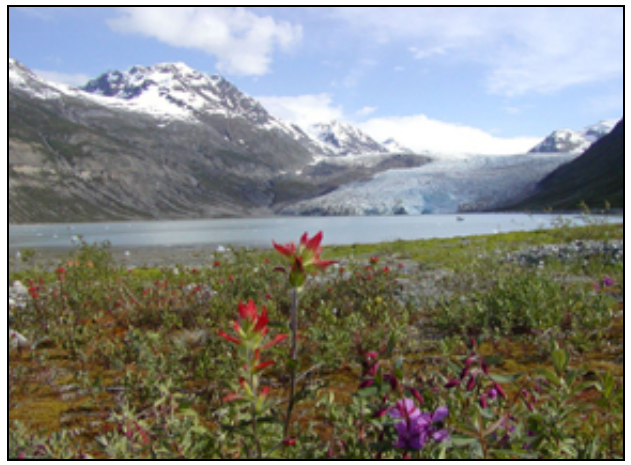
Retreating glaciers expose an elemental, primordial, yet resilient land that hosts a succession of marine and terrestrial life.

The Tlingit experience in the park and preserve created an ethnographic landscape of names and associated stories that extend into the pre-Little Ice Age past and reflect human adaptation to rapid glacial advance and retreat. The park protects, preserves, and shares this seminal story of human response to rapid landscape change.