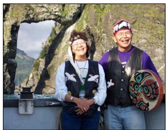
As the original people, the Huna Tlingit maintain strong spiritual ties to and an abiding sense of stewardship toward Glacier Bay.

The park recognizes, protects and actively manages, in collaboration with Tlingit clans and their tribal governments, a number of sacred places.