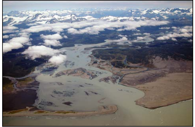
At Dry Bay, the Alsek River breaches the coastal mountains and flows to the sea, creating a large deltaestuary complex.

The Preserve is a portion of the homeland of the Ghuunaaxoo Kwaan and is a landscape that contains sacred sites that anchor Raven stories from the time of creation as well as several historic village sites.