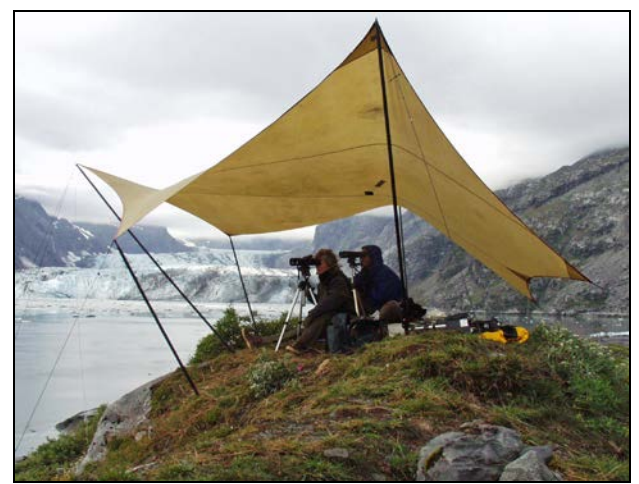
Researchers estimate harbor seal abundance in Johns Hopkins Inlet, where floating icebergs provide favored pupping habitat in early summer.

The Park Service fosters the application of acquired scientific knowledge to enhance understanding and stewardship of park resources.