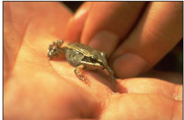
Wood frog – Rana sylvatica.

Through interpretation, park staff facilitate public understanding, appreciation, and protection of fish, wildlife, habitats, and management of diverse northwest Alaska ecosystems.