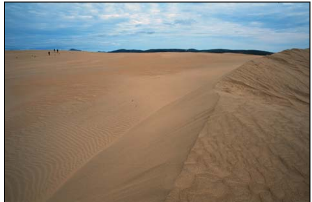
The Great Kobuk Sand Dunes.