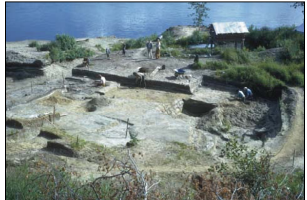
An archeological excavation at Onion Portage.