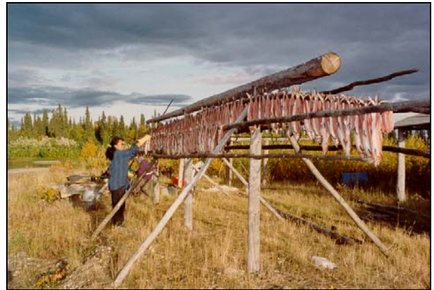
Drying whitefish along the Kobuk River.