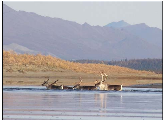
Caribou crossing the Kobuk River in autumn.