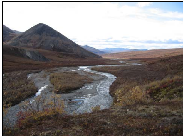
The upper Salmon River, a designated Wild River.