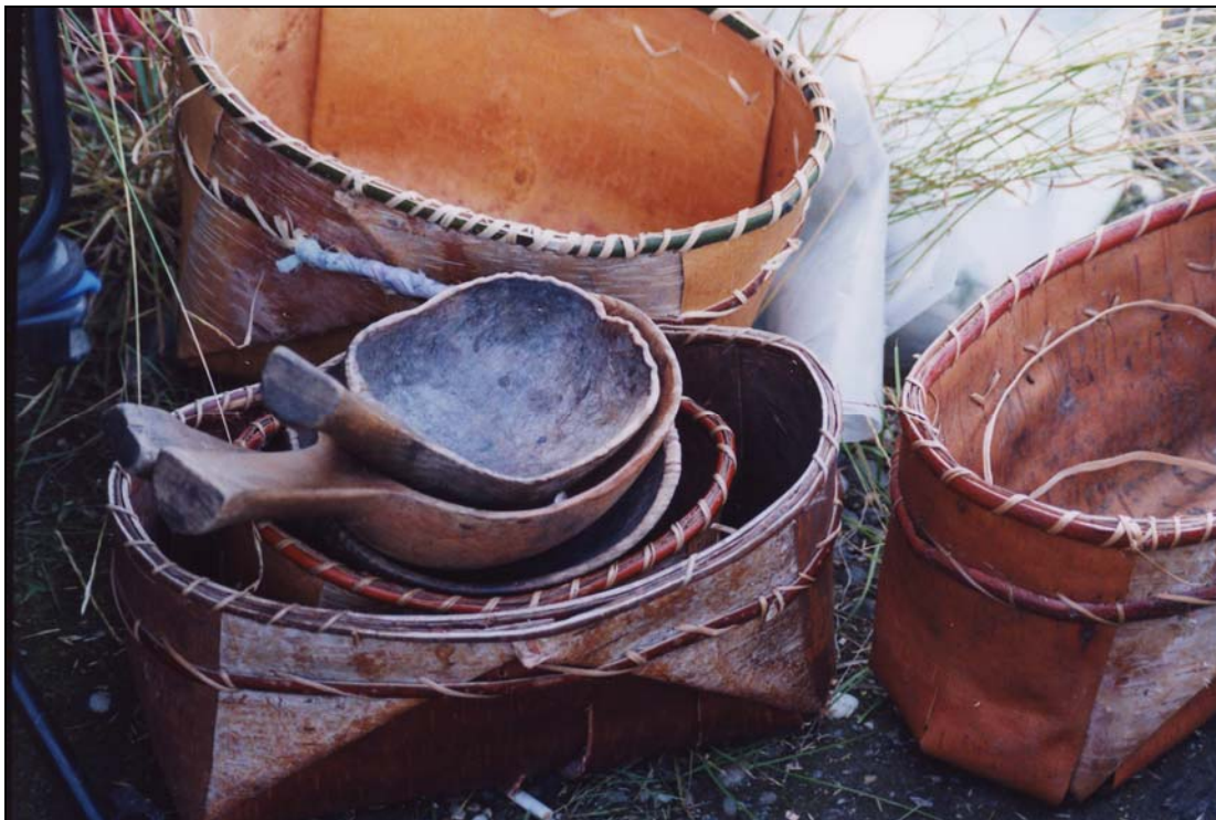
Birch bark baskets are a traditional craft of the Kobuk River region.