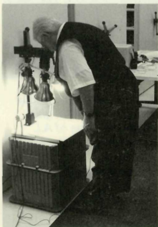
An NPS volunteer produces digital images of an artifact from the study collection.

physical representation of the unique development of Vancouver, and the entire Pacific Northwest.