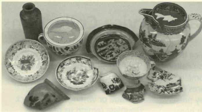
Transferprinted earthenware from England's Spode company was a common import, but ceramics from elsewhere in Europe, and China, have been found as well.

Fort Vancouver has yielded the largest recovered collection of 19th century Hudson's Bay Company artifacts in the world. They represent not only everyday life, but also the fort's position as the political, cultural, and mercantile center for the region. Imported items from Europe are found in great quantities, including ceramics, bottles, glassware, and personal ornaments. A large percentage