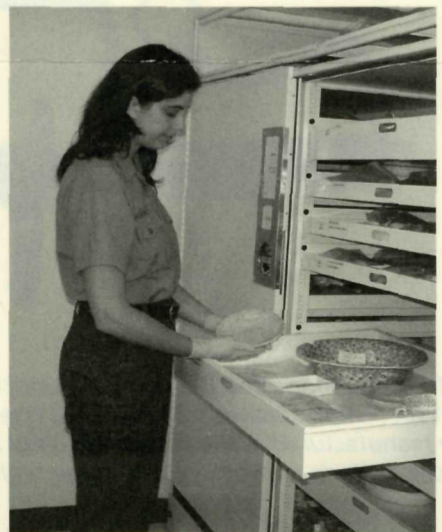
Artifacts are periodically surveyed by the Curator or Museum Technicians who look for changes in their condition.