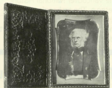
The daguerreotype photograph of Dr. John McLoughlin was taken in the Oregon Territory after he left his post with the Company.