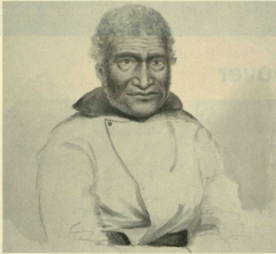
"Old Cox" by Paul Kane, 1846.