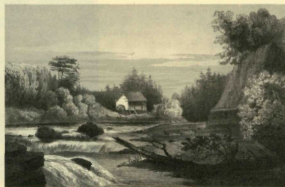
"Hudson Bay Mill." John Mix Stanley Lithograph.

Islanders are felling the pines and dragging them to the mill; sets of hands are plying two gangs of saws by night and day; nine hundred thousand feet per annum; are constantly being shipped to foreign ports." By 1844, more than 100 Hawaiians worked at Fort Vancouver, with 300-400 employed by the HBC at various Columbia River posts.