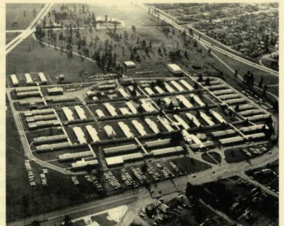
The Barnes Medical Center, originally meant to be temporary, survived to become a Veteran's Administration Hospital in 1946. This photo shows the complex in 1966. Courtesy of the Clark County Historical Museum, P83.5.4

including the 750-bed Barnes Hospital, was a self-sufficient city where nearly 1,000 members of the medical corps lived and worked.