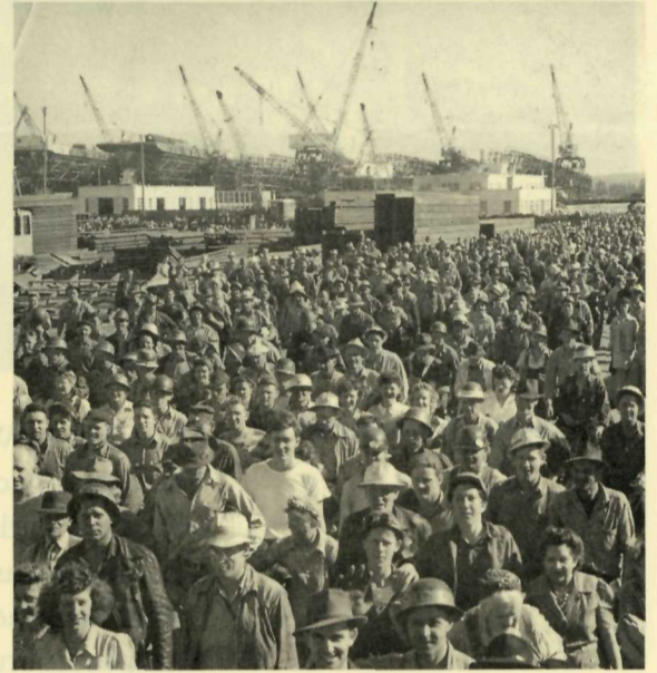
Kaiser workers attend the launching of a ship.

Of all the activities in the area, Kaiser was to have perhaps the greatest effect on the community. Not only did the town's population triple with rising employment, but Kaiser's responses to workers' needs contributed to the transformation of Vancouver's housing, social services, and makeup. To support employees, Kaiser established schools, daycares, medical care, and transportation systems, many of which served as models for more permanent versions.