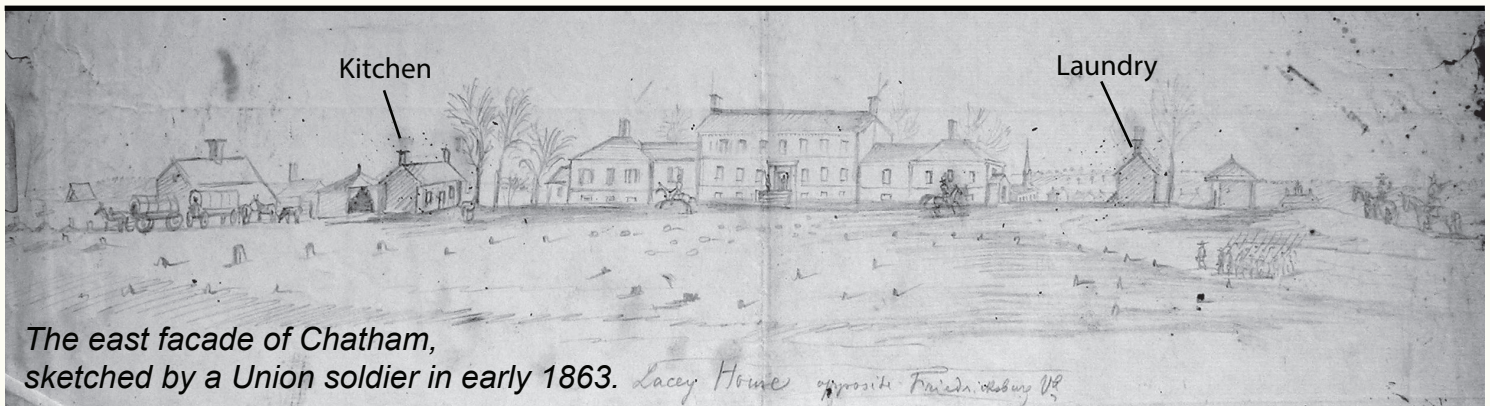
The east facade of Chatham, sketched by a Union soldier in early 1863. Lacey Home opposite Fredericksburg VA

The walled garden and most of the surviving outbuildings were built in the early 20th century.