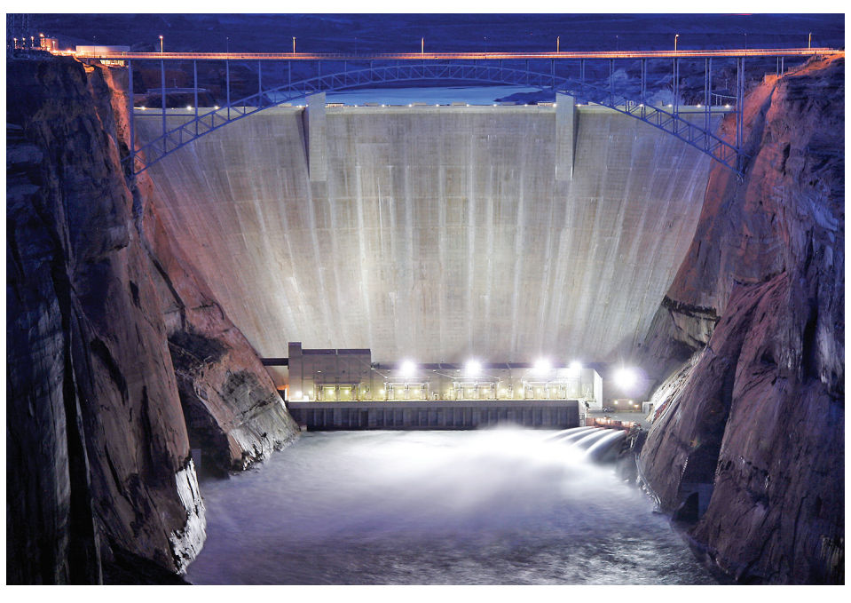
Glen Canyon Dam releases high flows of Colorado River water on the night of March 6, 2008. A high-flow experiment was undertaken to determine if water releases designed to mimic natural seasonal flooding could be used to improve a wide range of downstream resources in Glen Canyon National Recreation Area and Grand Canyon National Park.

n March 5, 2008, the Department of the Interior began a 60-hour highflow experiment at Glen Canyon Dam, Arizona, to determine if water releases designed to mimic natural seasonal flooding could be used to improve downstream resources in Glen Canyon National Recreation Area and Grand Canyon National Park. U.S. Geological Survey (USGS) scientists and their cooperators undertook a wide range of physical and biological resource monitoring and research activities before, during, and after the release. Scientists sought to determine whether or not high flows could be used to rebuild Grand Canyon sandbars, create nearshore habitat for the endangered humpback chub, and benefit other resources such as archaeological sites, rainbow trout, aquatic food availability, and riverside vegetation. This fact sheet summarizes research completed by January 2010.