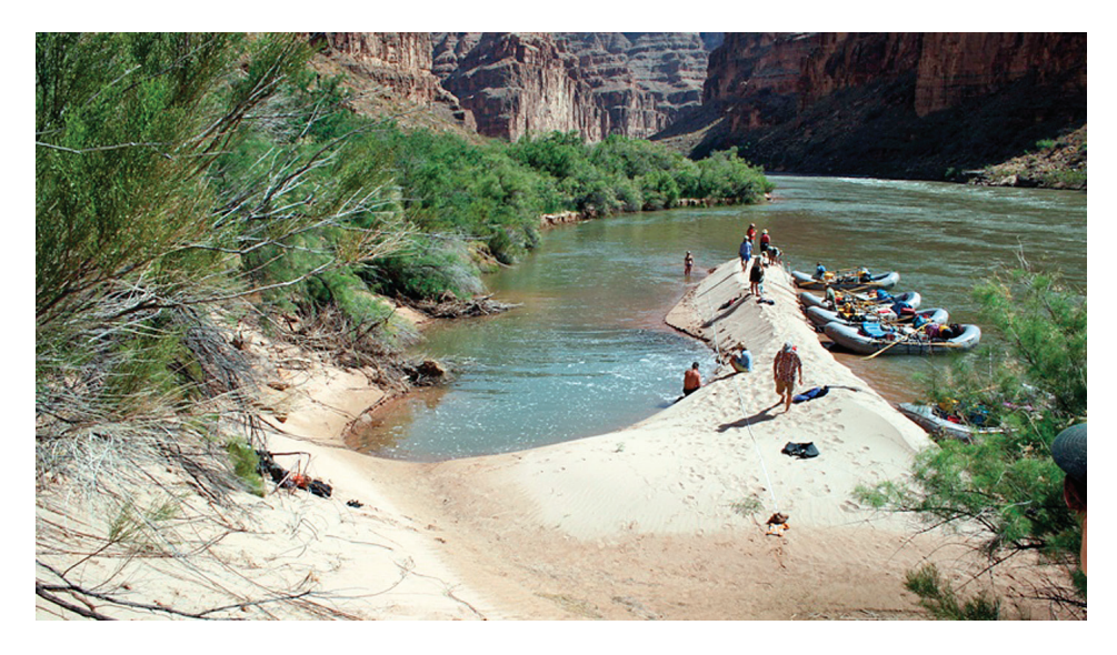
This sandbar in Grand Canyon was created as the result of the 2008 high-flow experiment at Glen Canyon Dam. To the left of the sandbar is a newly created backwater. Backwaters are areas of low-velocity flow that are thought to be used as rearing areas by the endangered humpback chub ( Gila cypha ) and other native fish. Sandbars also provide camping beaches for hikers and whitewater rafters.

quantity of aquatic invertebrates. However, the relative quality of food sources increased because the HFE reduced the New Zealand mud snail ( Potamopyrgus antipodarum ) population by approximately 80% and increased midges and black flies. Midges and black flies are high-quality food items for trout. In contrast, the mud snail is a nonnative aquatic invertebrate that has invaded the Lees Ferry reach in large numbers and is considered a nuisance species because the snails cannot be digested when eaten by rainbow trout.