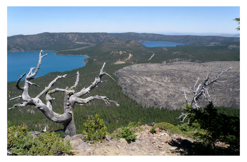
Newberry Volcano, Oregon, is the largest volcano in the Cascades volcanic arc. This north-facing view taken from the volcano's peak, Paulina Peak (elevation 7,984 feet), encompasses much of the volcano's 4-by-5-milewide central caldera, a volcanic depression formed in a powerful explosive eruption about 75,000 years ago. The caldera's two lakes, Paulina Lake (left) and the slightly higher East Lake (right), are fed in part by active hot springs heated by molten rock (magma) deep beneath the caldera. The Central Pumice Cone sits between the lakes. The mostly treeless, 1,300-year-old Big Obsidian Flow, youngest lava flow on the volcano, is surrounded by forest south of the lakes.

Rising gradually southward to 4,000 feet above the City of Bend, Oregon, Newberry Volcano appears from Bend as a broad ridge on the horizon. Extending approximately 75 miles north to south and 27 miles east to west, the shield-shaped volcano and its extensive apron of lava flows cover almost 1,200 square miles, an area about the size of the State of Rhode Island, making it the largest volcano of the Cascades volcanic chain. This giant volcano is unlike a typical Cascade Range cone-shaped volcano (called a "stratocone"), such as South Sister to the west of Bend or Mount Rainier in Washington. Instead, Newberry is a "composite volcano" formed by diverse styles of eruption and has as many as 400 volcanic vents scattered across its