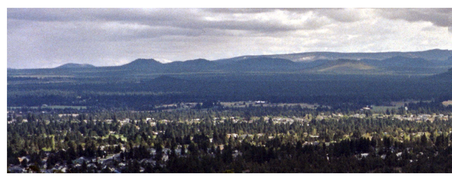
Looking south from Pilot Butte in Bend, Oregon, the broad shield of Newberry Volcano rises nearly 4,000 feet above the city and the surrounding highdesert terrain. Because this giant volcano does not have the typical cone shape of most Cascades volcanoes and appears to be a small range of low mountains, most people do not recognize this sleeping giant as a volcano. The high-standing part of Newberry covers about 40 miles north-south by 25 miles east-west. Numerous cinder cones (conical hills formed of cooled blobs of frothed lava) are scattered across the flanks of the shield, evidence of repeated volcanic activity.

about 40 miles north-south by 25 miles east-west and encompasses nearly all of the volcano's vents. However, Newberry's lava flows extend much farther than this high part and to the north include the area of what is now downtown Bend, as well as the Redmond Municipal Airport. About 350,000 years ago, an early lava flow erupted from Newberry and flowed north until it reached Smith Rock, where it filled and moved down the channel of the Crooked River and also shifted the channel of the Deschutes River.