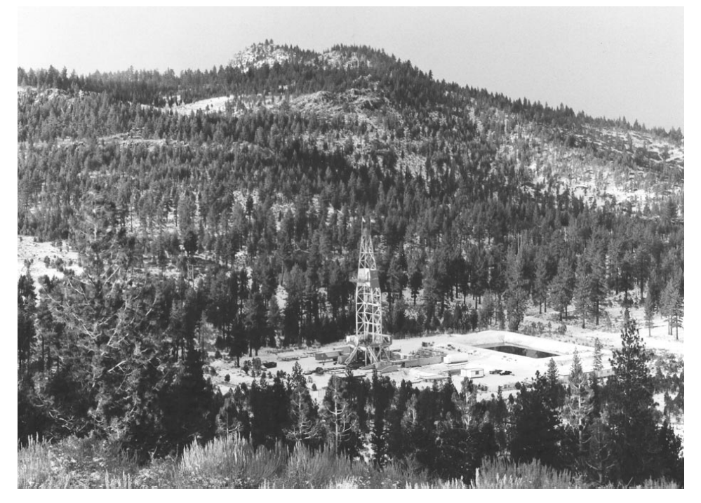
The Long Valley Exploratory Well is sited directly over the center of uplift on Long Valley Caldera's resurgent dome. Phase III drilling, begun in the summer and lasting through the fall of 1998, will extend the 7,200-foot-deep hole to between 11,500 and 13,000 feet, and greatly increase scientific knowledge of this restless volcano.

Long Valley Caldera was produced by a catastrophic eruption about 760,000 years ago and has recently been showing signs of unrest. Since 1980, when renewed earthquake activity and ground deformation caused concern over a possible volcanic eruption, scientists with the U.S. Geological Survey (USGS) have been closely monitoring the Long Valley region. Recurring earthquake swarms and uplift of the central sec-