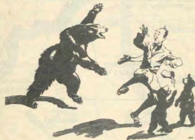
BEARS FED OR FOOLED WITH ARE DANGEROUS BEARS