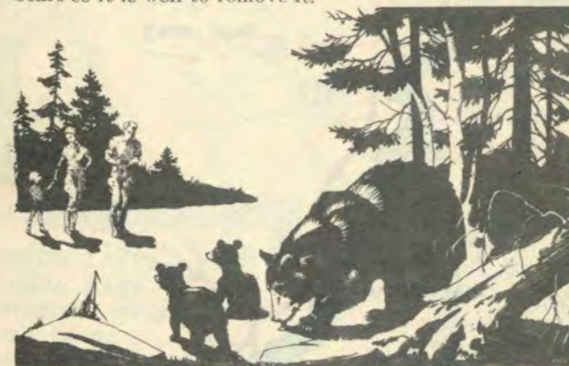
BEARS AT A DISTANCE ARE "SAFE" BEARS

Bears are very interesting, but it is dangerous to approach too closely. If you photograph them you do so at your own risk and peril. The feeding, touching, teasing, or molesting of bears is prohibited. Food left in cars attracts bears so it is well to remove it.