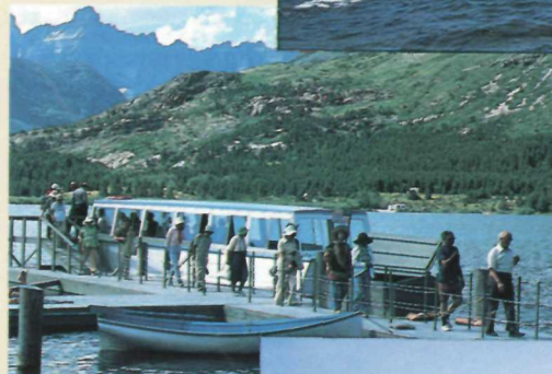
Passengers boarding Chief Two Guns on Swiftcurrent Lake.

The Sinopah plies Two Medicine Lake, dwarfed by its namesake mountain at right, with Painted Tepee to the left.