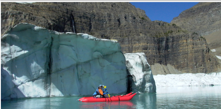
USGS scientist Lindsey Bengtson paddles along the margin of Grinnell Glacier to complete a GPS margin survey.

^^ At current rates of retreat it is assumed that in 2010 this glacier no longer exceeds 100,000m 2 .