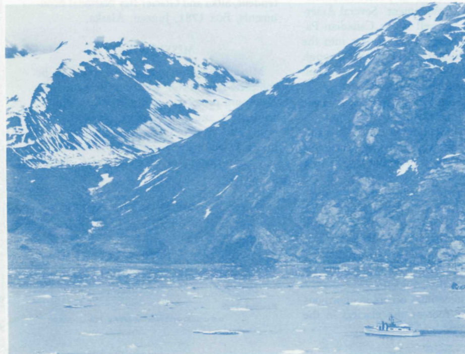
Margerie Glacier ice cliffs from a safe distance of a half mile.