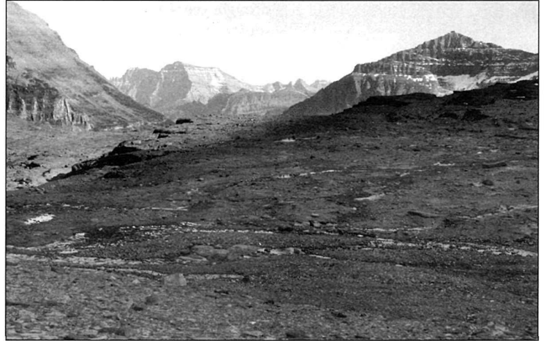
Boulder Glacier in 1938 and the same location 60 years later in 1998.