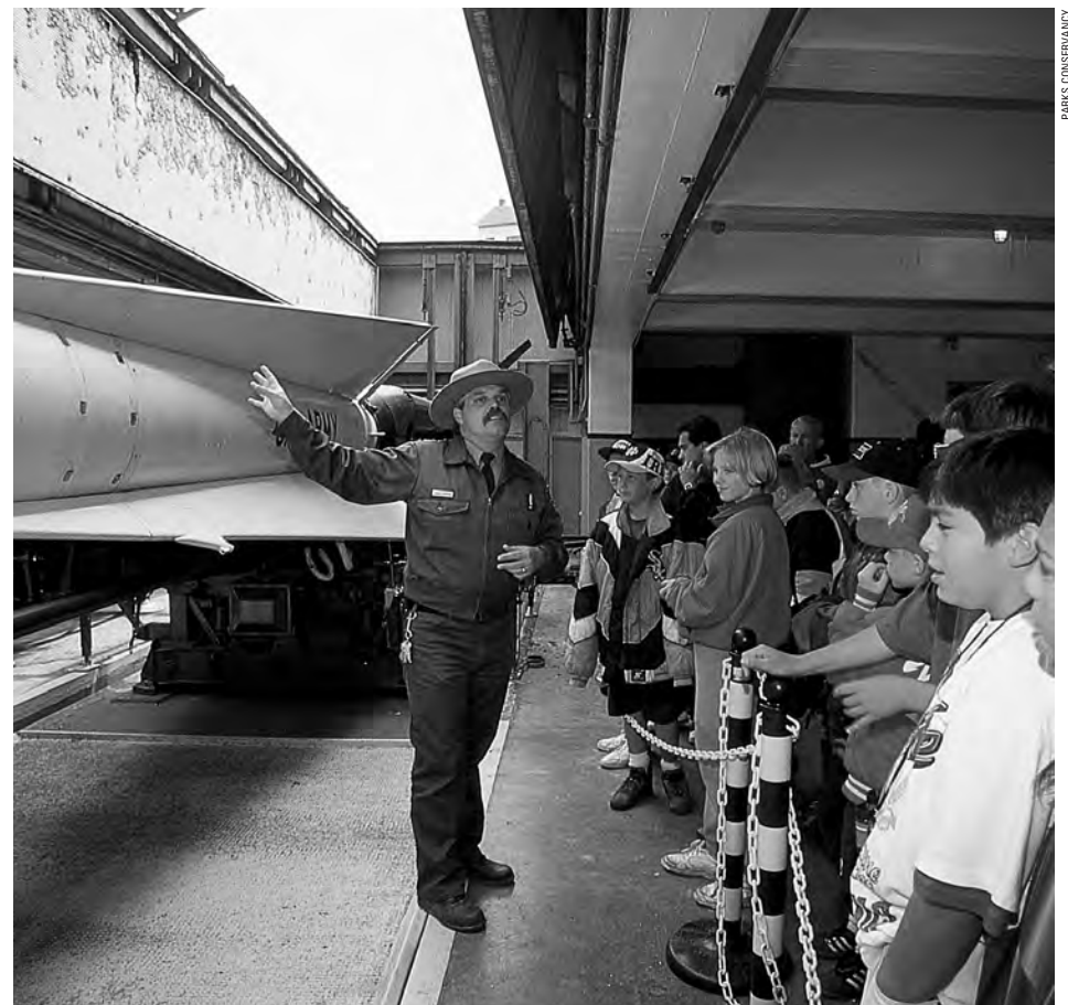
Schoolchildren get the scoop on the Nike Missile Site from a ranger well-versed in its history. NPS interpretive rangers have inspired generations of visitors to learn more about their national heritage.