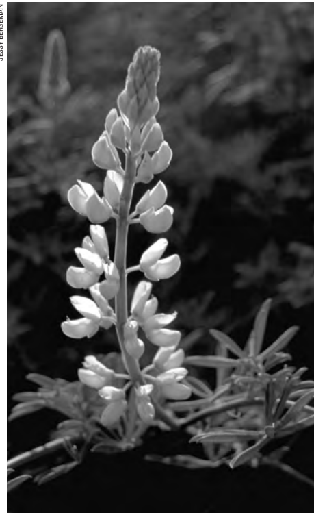
Yellow Bush Lupine

preserve their own heritage, open space, and recreation resources. Grants and assistance are offered to register, record, and save historic places; to create state and community parks, trails, and greenways; and to build local recreation facilities. The Service also consults with other countries as they establish and operate their parks and protected areas.