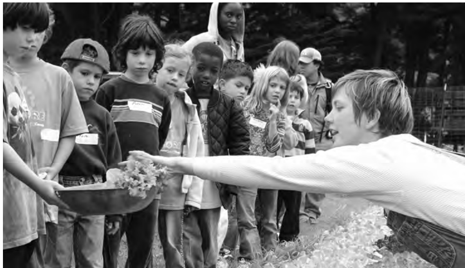
Crissy Field Center program