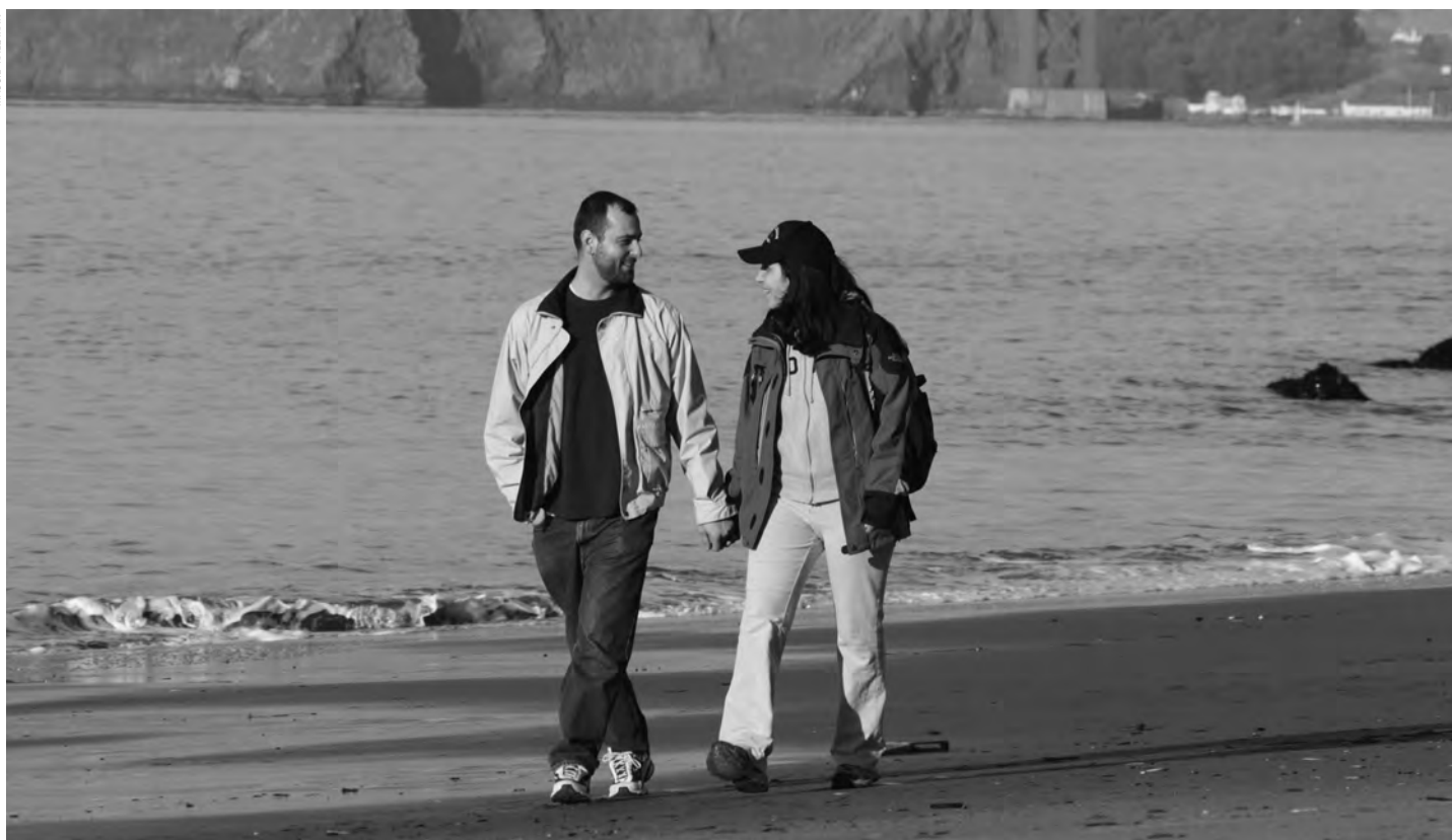
Beach-walking is a wonderful way to reconnect. The Golden Gate National Parks, with their miles of beaches, are a haven for the Bay Area's city-stressed residents.