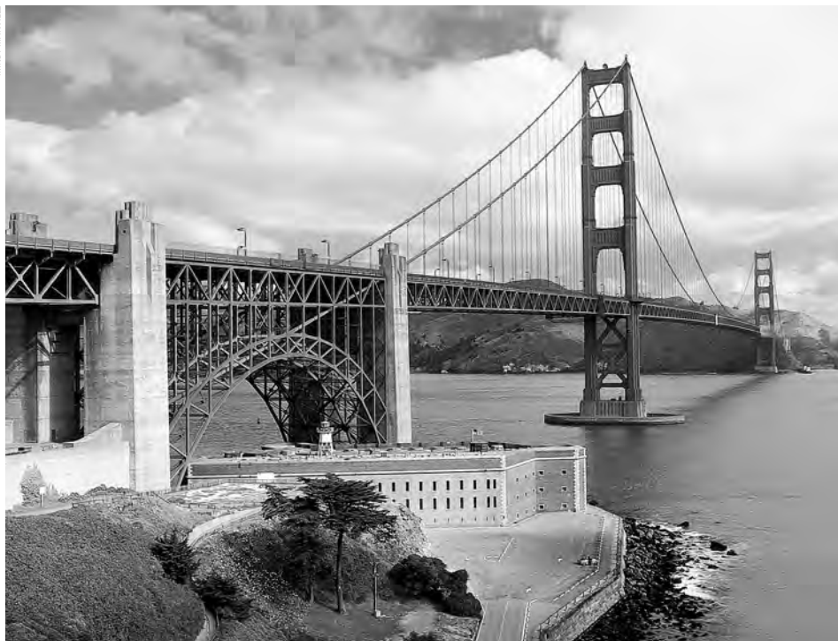
Long before the Golden Gate Bridge was built, Fort Point stood watch over the southern edge of the entrance to San Francisco Bay. Today, this national historic site keeps alive the stories of California's early days and its role in the Civil War.

At Golden Gate, we hope that each of you will work with us to fulfill this responsibility and promise.