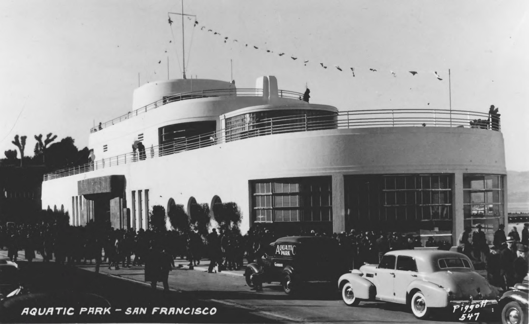
AQUATIC PARK - SAN FRANCISCO