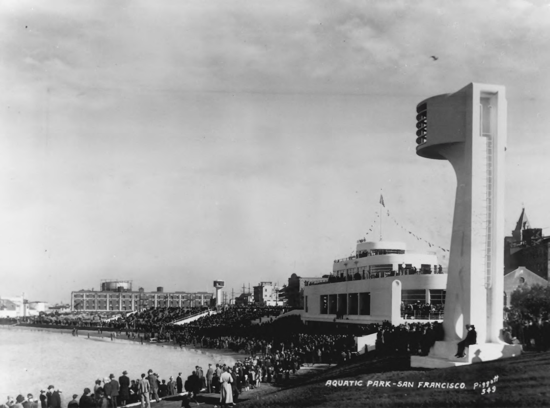
AQUATIC PARK - SAN FRANCISCO. Piggott 549