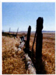
Ties from grade near Matlin