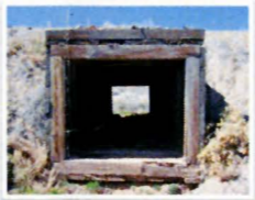
Large box culvert