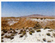
The Dove Creek Fill