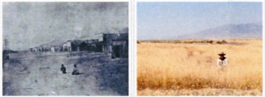
Terrace, then and today