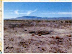
Turntable at Terrace