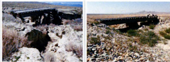
Trestle Stabilization, before and after.