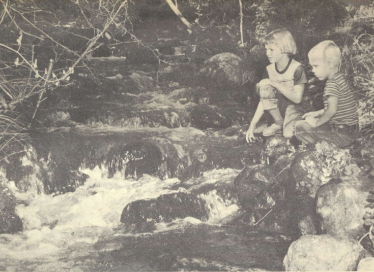
Watching fish in Lehman Creek near monument headquarters.