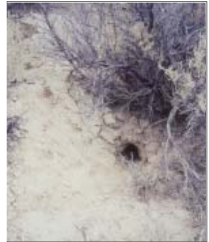
Pygmy rabbit burrow