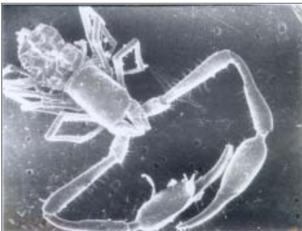
Electron scanning microscope photo of a pseudoscorpion