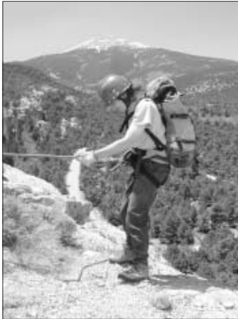
Some caves will require a rappel just to get to the entrance

The cave crew is going to be up at high elevation most of the summer. We are busy exploring and mapping the alpine caves of the park. In the park, any cave with an entrance at 9000 feet or higher is considered alpine; fifteen of the park's 43 caves fit this description, including the deepest cave in Nevada, as well as the cave with the highest elevation entrance in the state. In addition to mapping the known caves above 9000 feet, the crew will be looking for new caves in the southern part of the park. This area of the park is