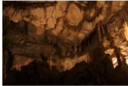
Gothic Palace with old lights.

During last summer, fall and winter, park staff have replaced the incandescent bulbs with Light Emitting Diodes (LEDs). LEDs last an average of 50,000 hours, are resistant to shock, operate at low temperatures, and consume one third the amount of electricity. The truer color rendition of LED's show off the caves wide range of colors and should reduce algae.