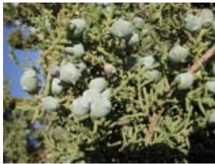
Utah juniper leaves and berries.

From whatever direction you approach Great Basin National Park, probably the first tree you will see as you climb the mountain toward the park boundary will be Utah juniper ( Juniperus osteosperma ). The global distribution of Utah juniper is from eastern California to Utah and the six states that Utah borders. Except for the extreme northwestern portion of the Great Basin, Utah juniper is present and often dominant throughout the mountains of the Great Basin, and at Great Basin National Park it is one of the most abundant of all tree species. Utah