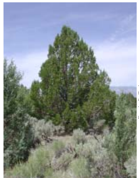
Rocky Mountain juniper.

mixed pinyon-juniper woodlands and near a stream, you are likely to find a juniper that looks a little different from the Utah juniper. You have probably found what is called the Rocky Mountain juniper ( Juniperus scopulorum ). Its bark is also shreddy and can also be grey, sometimes grayish-red, but never whitish. The "berries" are smaller, and the branchlets with leaves are always just under 1 mm wide, but only some trees will have berries, while others will have only male cones. When the pollen is being released from the male cones and when the berries are ripe, you may think you are seeing two different species, as the males will have a brown-amber hue and the females will be bright and bluish. The branches have a tendency to droop, and when the wind blows hard, the branches show much more movement than the Utah junipers. Rocky Mountain juniper is much broader in its distribution than Utah juniper, from western Canada to southern New Mexico. It is aptly named, as its distribution is centered on the Rocky Mountains and occurs very nearly its entire length. In the park, the species descends below park boundaries in the east to 6,000 ft elevation in Snake Creek and up to 9,140 ft at upland sites. It is