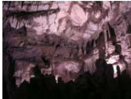
Gothic Palace with new LED lights.