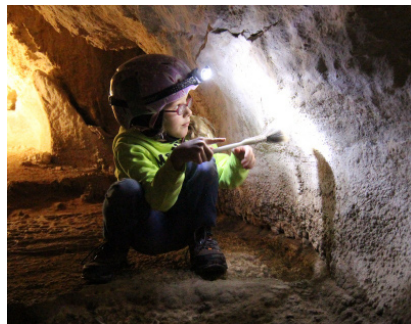
This young lint camp volunteer helped dust off a dusty cave wall.

Teams worked in different parts of the cave. Some picked lint off formations high above the Music Room, while others removed hairballs and trash from staircases and along the edges of the trail. In the Inscription Room, teams uncovered rimstone dams and flowstone that have been buried by old debris for decades. They removed over 3,000 pounds of debris and sand originally brought in for old trails and trail-making activities. They also found items of archeological interest,