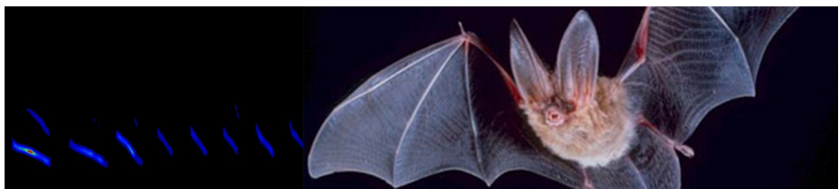
Townsend's big eared bat ( Corynorhinus townsendii ) and full spectrum call pattern.