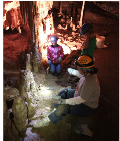
Volunteers find the real cave floor in the Inscription Room, buried under sand.