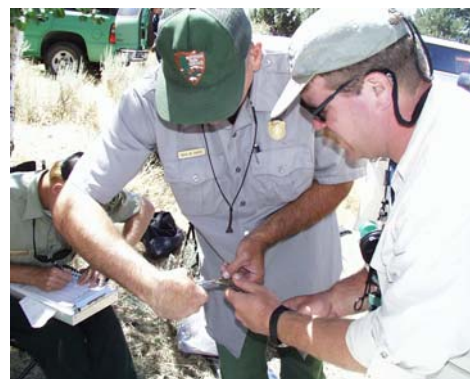
Clipping a Bonneville cutthroat trout fin for a genetics sample

Additional work this summer included developing a recreational fisheries brochure, improving data collection and data entry, and conducting fire rehabilitation work on the Granite Fire in the South Fork of Big Wash.