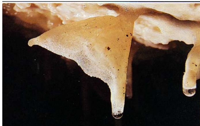
Physical inventories will include cave formations like this soda straw.

The initial cave mapping and surveying will give us insight into the structural framework of each cave. The next step will be to conduct a comprehensive physical inventory to determine the types of resources present in each cave. From the cave inventory, we will gain a knowledge of where sensitive formations are located