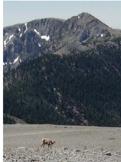
13-year old Bighorn ram on Mt. Washington

A second problem found through the bighorn habitat GIS modeling was inadequate lambing area, due to a lack of available open water