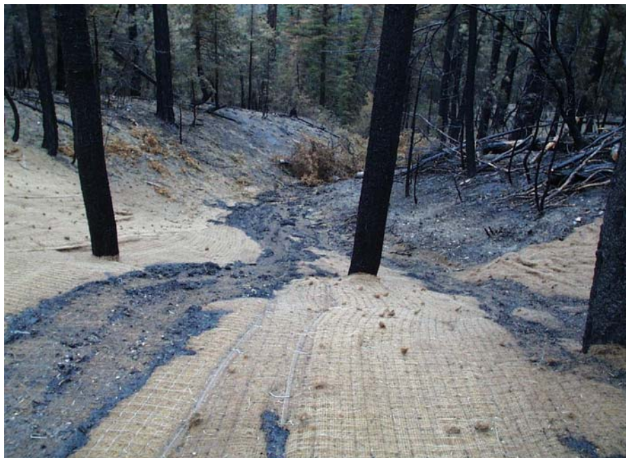
Erosion Matting in South Fork of Big Wash Watershed

As of the beginning of November, the rehabilitation project is nearly complete. After two rain events, the treatments are working as planned, and we have confidence that the rehabilitation will be successful.