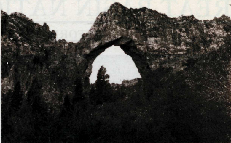
Spectacular Lexington Arch: A natural product of water and wind erosion.

If you plan to photograph Wheeler Peak and its close neighbor Jeff Davis Peak, the early morning is the best time to see the alpenglow contrasting out the snow covered peaks and deep blue sky.