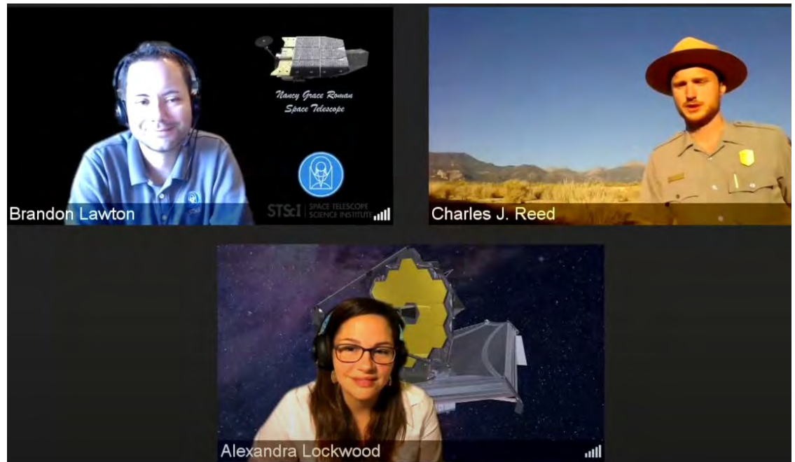
Caption: "Ask-the-Experts", a virtual event during the Astronomy Festival where visitors were able to submit questions to experts from the Space Telescope Science Institute to be answered during the virtual festival presentation.

park's Youtube Chanel . The goal was to inspire people to learn more about the night sky that we all share. The park was able to provide programming to over 500 visitors in the span of the three-day festival. Through partnerships with the Space Telescope Science Institute, the Great Basin Observatory, and the International Dark-Sky Association, Great Basin National Park was able to produce seven virtual programs. These virtual programs covered many exciting and interesting subjects such as how to stargaze on your own, a stargazing guide for the festival, and talks from guest speakers. We welcomed scientists from the Space Telescope Science institute in an "Ask-the-Experts" virtual program where experts answered questions from visitors about the new James Webb and Nancy Grace Roman space telescopes. Great Basin National Park will strive to continue programming like this into the future, hoping to give visitors of all ages that "aha moment".