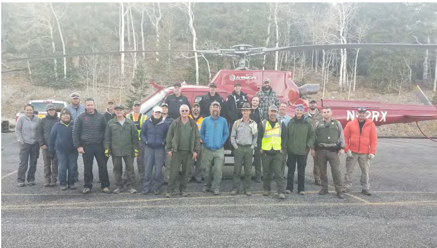
Caption: Great Basin National Park staff rely on the work of volunteers, EMT's, and White Pine County workers to maintain a reliable safety network for when accidents happen, and visitors need our help.