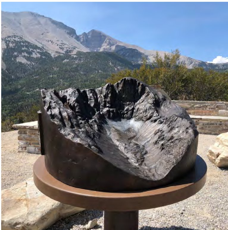
Caption: Through partnerships this new bronze map will allow visitors to “see” inside the Wheeler Peak Cirque.