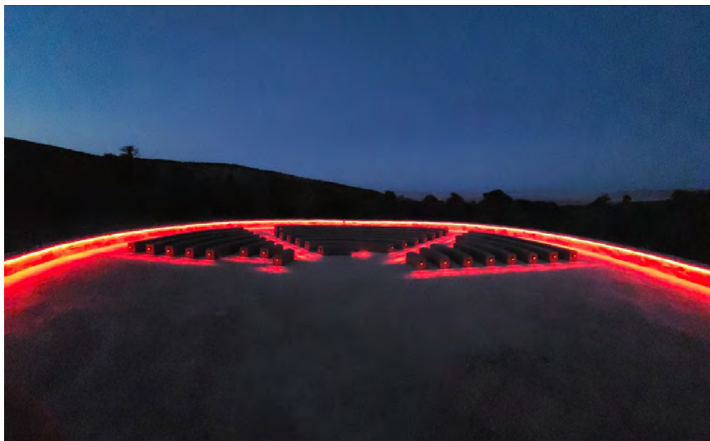
Caption: The red light preserves an individual's night vision, making it safer for them to walk around the new amphitheater to view the night sky.

chirping bats. Many of the exhibits are interactive and hands on. Visitors learn about the darkness zones in the cave, what lives in the cave, and how the cave is protected. The exhibits also allowed the park to update the science on how the cave was formed. Want to learn more about the cave? Continue on to our website for more information.