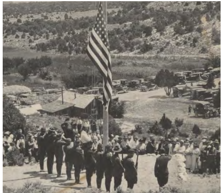
Caption: The image above depicts the ceremonial raising of the U.S. Flag for the dedication ceremony of what once was Lehman Caves National Monument.

Watch for "Highlights of History" through 2021. Join us for the special centennial celebrations in 2022, including a rededication ceremony and flag raising on August 6th, 2022.