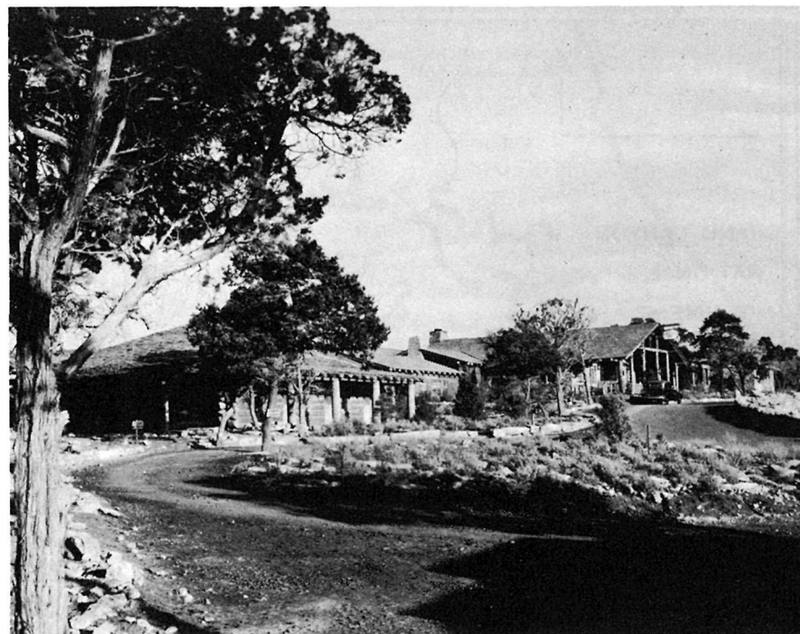
BRIGHT ANGEL LODGE

EL TOVAR HOTEL. —Situated on the very brink of the chasm, El Tovar is one of the most famous resort hotels in the Southwest. It is built of native boulders and pine logs, with more than 80 guest rooms. Rates range from $2.50 per day, European plan, for one person in a room without bath, to $11.50 and up per day, American plan, for two persons in a room with bath. Meals are: Breakfast, $1; luncheon, $1; dinner, $1.50. For children from 3 to 7