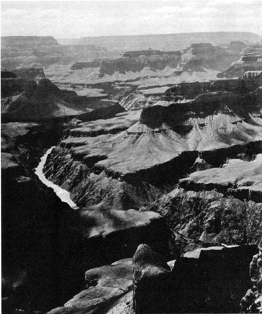
VIEW OF CANYON FROM MOJAVE POINT

Las Vegas, Nev., where connections are made with United Air Lines and Western Air Express. These flights are under the management of the Grand Canyon Airlines, and leave from the airport at De Motte Park, 18 miles from the North Rim headquarters.