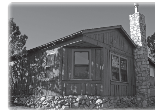
Caretaker’s Cabin today