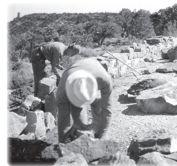
CCC “boys” at Navajo Point; note the Watchtower on the horizon

As you walk the path up the hill, reflect back to the men of the Civilian Conservation Corps (ccc) who lived and worked at Grand Canyon from 1935 to 1942. While living in barracks, they completed more than twenty projects at Desert View including trails, rock walls (below), roads, and buildings. Ccc crews built the stone-walled building on your left (2) in 1941 as a restroom. The crews’ attention to detail shows the pride they had in their accomplishments.