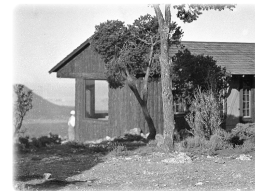
Caretaker’s Cabin in original location

On the left farther along the path, the house with two chimneys (3) (below) is the oldest building at Desert View. Originally constructed near the rim in 1927, it served as a place for visitors to rest, eat, and view the canyon. Following the construction of the Watchtower, it was moved to its current location and functioned as the caretaker’s cabin. It retains some of its original glass and exterior siding and stone work, and today is used as an office. Imagine all of today’s visitors trying to enter this building for tea!