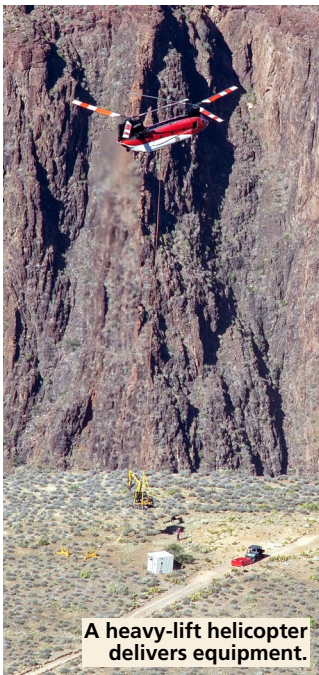
A heavy-lift helicopter delivers equipment.

In Fiscal Year 2023, 21 concessioners grossed approximately $203 million and paid franchise and other fees of approximately $19 million.