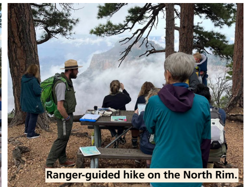
Ranger-guided hike on the North Rim.