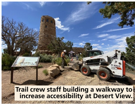
Trail crew staff building a walkway to increase accessibility at Desert View.