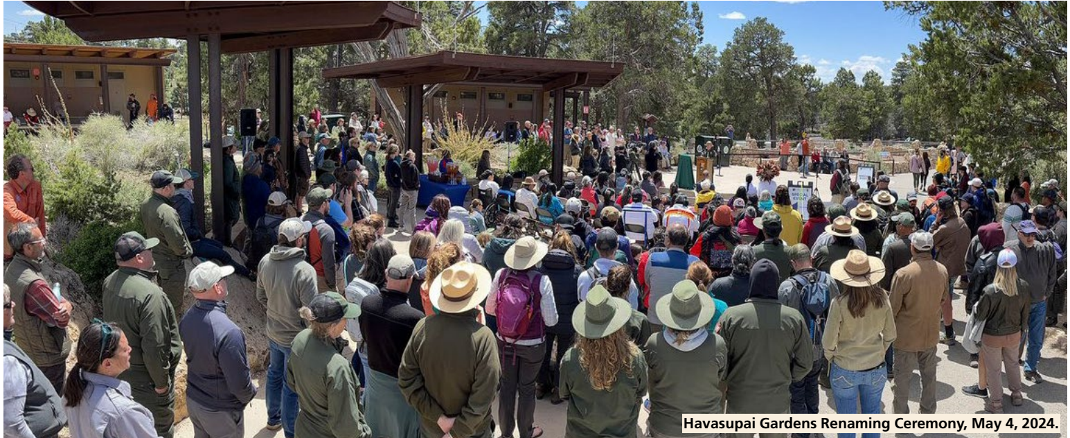
Havasupai Gardens Renaming Ceremony, May 4, 2024.