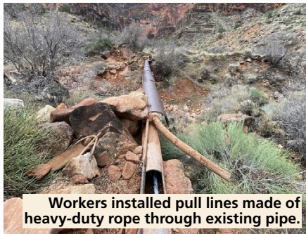
Workers installed pull lines made of heavy-duty rope through existing pipe.