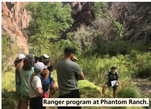
Ranger program at Phantom Ranch.

Facebook followers: 786,243. Instagram followers: 866,000. Twitter followers: 287,533. Total nps.gov/grca page views: 14,266,129.