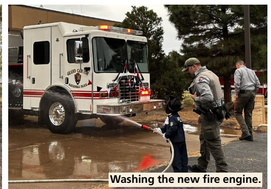
Washing the new fire engine.