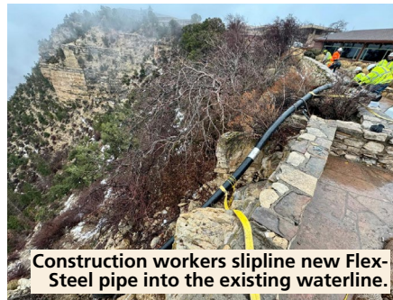
Construction workers slipline new Flex-Steel pipe into the existing waterline.