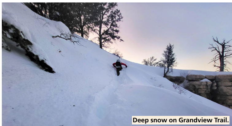
Deep snow on Grandview Trail.

Since precipitation totals are low, year-to-year variations can be large. The passage of a few major storms can have a significant impact on the year’s total.