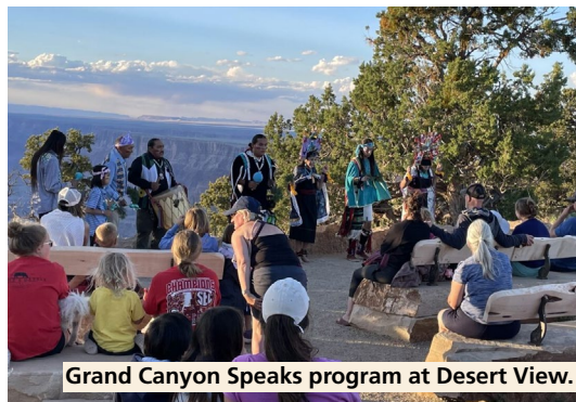
Grand Canyon Speaks program at Desert View.