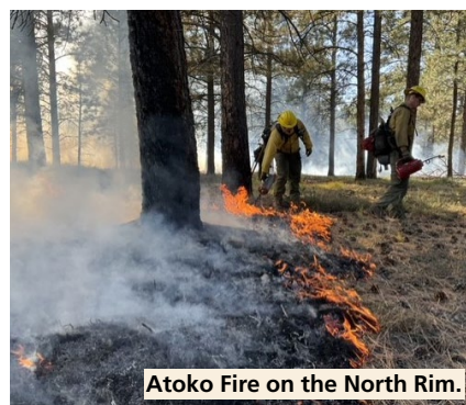
Atoko Fire on the North Rim.