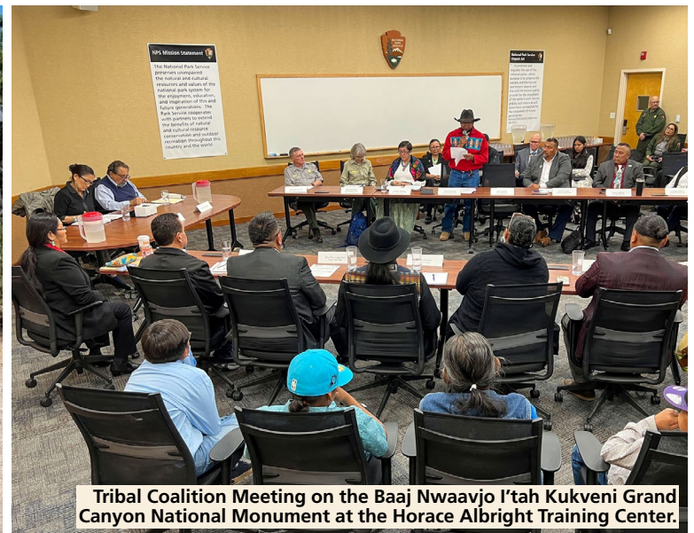
Tribal Coalition Meeting on the Baaj Nwaavjo I'tah Kukveni Grand Canyon National Monument at the Horace Albright Training Center.