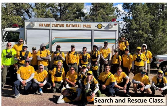
Search and Rescue Class.

Fire Start Incidents: 10 South Rim, 8 North Rim. Acres treated with wild & prescribed fire: 912 South Rim, 1,920 North Rim. Acres of defensible space treated: 187.