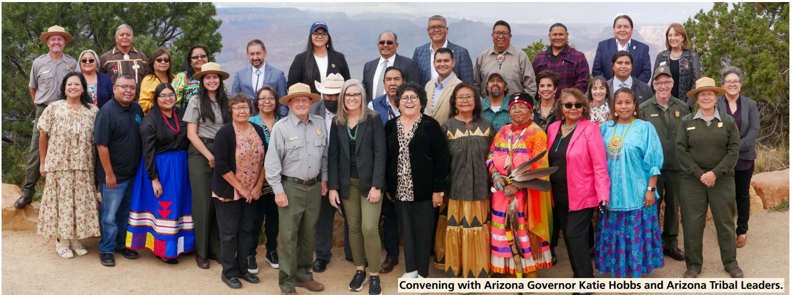
Convening with Arizona Governor Katie Hobbs and Arizona Tribal Leaders.

Total volunteers in park: 507; Total hours: 33,515.5; National value of each volunteer hour: $31.80; Total in-kind services: $1,065,792.90.