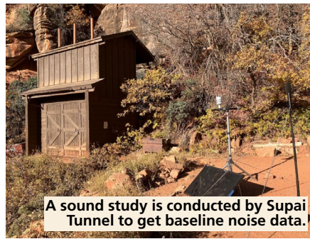
A sound study is conducted by Supai Tunnel to get baseline noise data.