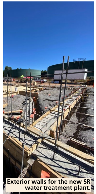
Exterior walls for the new SR water treatment plant.