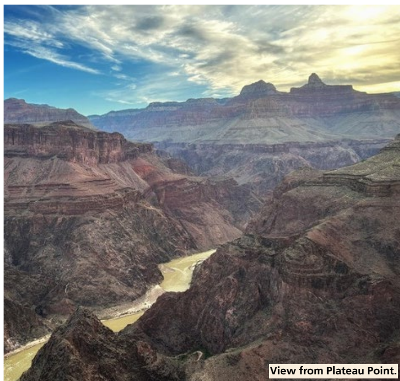
View from Plateau Point.

Paleontology resources include nearly 300 diverse and globally significant fossil localities ranging from 1.2-billion-year-old stromatolites to Paleozoic trilobites, plants, reptile tracks, and marine invertebrates, and Pleistocene megafauna in caves.