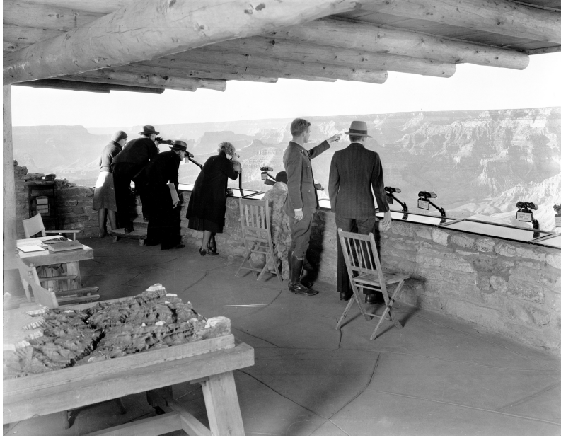
Fig. 2. Edwin McKee interprets the Canyon to visitors at Yavapai Observation Station. Note the variety of interpretive devices, including the relief model of the Canyon and binoculars with interpretive labels; the glass cases visible beneath them contained exhibits. GRCA 05829, Grand Canyon Museum Collections.