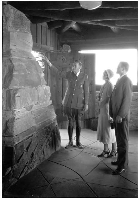
Fig. 3. An interpretive ranger describes the geology of the Canyon using the famous rock column McKee developed. A similar interpretive device is used at Yavapai Observation Station even today. GRCA 05823, Grand Canyon Museum Collections.