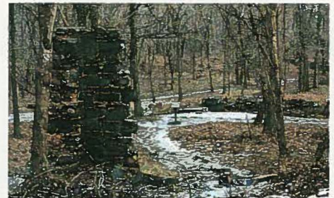
Partial remains of Matildaville.

1828 the Chesapeake and Ohio Canal Company bought the old Patowmack Canal and its rights and began construction of an ambitious canal system—a