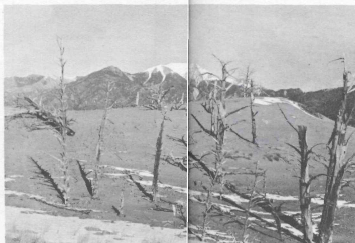
Smothered by a moving dune, skeletons of pines emerge to windward after the dune is passed