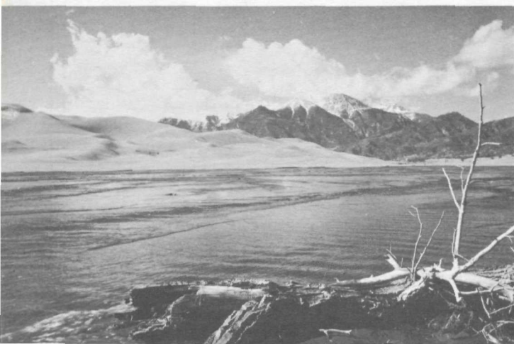
The beauty of the dunes is enhanced by the snow-capped Sangre de Cristo Mountains