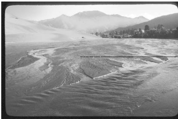
Fig. 4. View looking upstream (north) up the braided channel of Medano Creek, at the Great Sand Dunes National Monument. The active dune field is at left. Medano Creek is renowned for its surging flow during the spring runoff season (Schumm et al., 1982). During peak flow (ca. 50 cfs at the range front), the creek flows for about 8 km before it sinks into the valley floor.

At the low point in the basin, the San Luis Lakes comprise a hydrologic sump, separated by a low