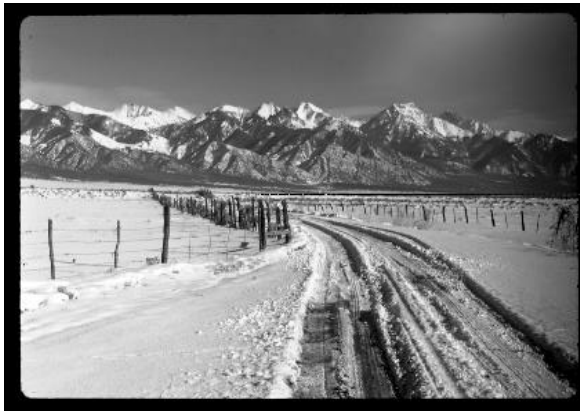
Fig. 1. Winter view of the eastern Alamosa Basin and Sangre de Cristo Range, looking southeast toward Crestone. Highest peaks are Crestone Peak (left, elevation 4319 m) and Kit Carson Peak (right, elevation 4317 m).

The San Luis Valley (SLV) of south-central Colorado is a major physiographic and structural element of the Rio Grande rift. The valley measures 75 km wide (east-west) and 160 km long (north-south) with an average floor elevation of ca. 2440 m. It is flanked by the San Juan Mountains (to the west) and the Sangre de Cristo and Culebra Ranges (to the east), both of which contain peaks higher than 4270 m (Fig. 1). This paper describes the general geology of the northern part of the valley from Poncha Pass at its north end to approximately the latitude of Alamosa, Colorado.