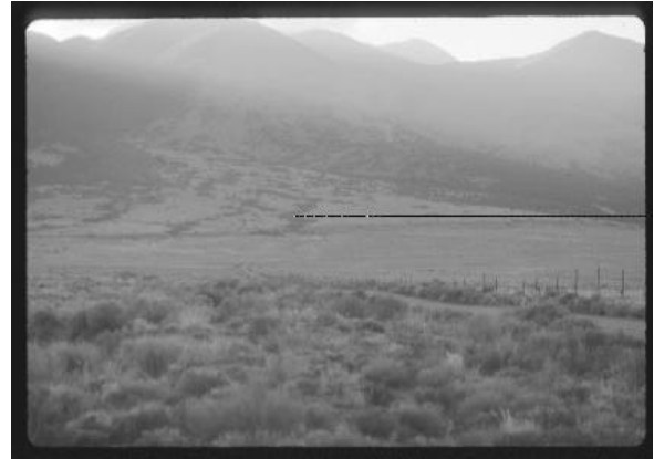
Fig. 10. The largest fault scarp in the Villa Grove fault system trends across the photo at center, after splaying off the range front Sangre de Cristo fault zone (off the photo to right). At this location the scarp is 8.2 m high and has a maximum scarp slope angle of 27 degrees.

per faulting event is 1.2-2.9 m, 2) long-term return times for M > 7 earthquakes are 10-47 kyr, and 3) the latest two M > 7 paleoearthquakes occurred about 10-13 ka and 7.6 ka. Based on these data, the Sangre de Cristo fault has experienced Holocene displacement and is thus one of Colorado's few active faults by common definition (Kirkham and Rogers, 1981). Colman et al. (1983) show young faults and Quaternary deposits in this area.