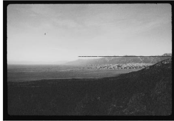
Fig. 5. Dunes in the Great Sand Dunes National Monument (right center) rise 185 m above the valley floor, and are a result of southwesterly winds funneling through Medano and Mosca Passes (out of sight to right). High peaks of the Crestone group are visible above the dunes, and the Villa Grove reentrant is visible in the distance at left center. Photo was taken from the head of the North Zapata alluvial fan, looking north.

topographic divide from the Rio Grande drainage basin to the south. Sandy basin fill around the sump area has been mobilized as eolian sand, which has been transported northeast and piled up into the 185 m- high dunes (Fig. 5) of the Great Sand Dunes National Monument (Johnson, 1967).