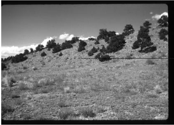
Fig. 8. A typical fault scarp across an alluvial fan surface along the Sangre de Cristo fault zone. The scarp is located at Uracca Creek on the western edge of the Blanca Peak massif, is 9.3 m high, and has a maximum scarp slope angle of 23 degrees.