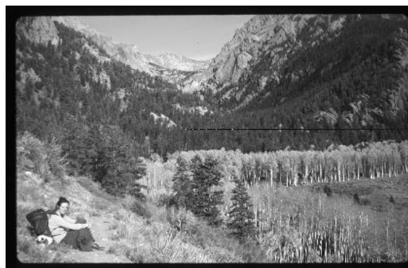
Fig. 8. The U-shaped valley of Willow Creek (center) was carved by glaciers through the resistant strata of the Crestone Conglomerate. The aspen-fringed meadow at lower right is Willow Park, a moraine-dammed lake basin (also seen in Fig. 3).

The most distinctive Paleozoic formation, which crops out over most of the Sangre de Cristo Range, is the Sangre de Cristo Formation (Pennsylvanian-Permian; equivalent to the Maroon Formation of central Colorado). The formation ranges from 1676 to 2930 m thick, and is dominantly composed of cyclotherms in piedmont-facies alluvium, with a basal arkosic conglomerate grading upward to finer sandstones and local nodular limestones. A very coarse-grained lens, the Crestone Conglomerate (Fig. 7), contains boulders up to 10 m in diameter and represents proximal alluvial fan material derived from the Uncompahgre highland to the west (Lindsey et al, 1986).