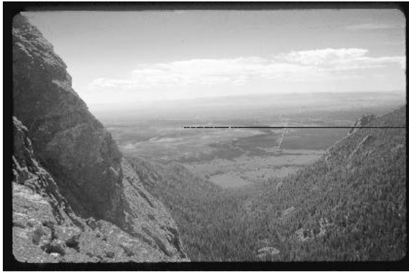
Fig. 3. View down the glaciated valley of Willow Creek, immediately north of Kit Carson Peak, looking west toward the valley floor and the Baca Grande land grant. In center foreground is Willow Park, an infilled lake basin impounded behind latest Pleistocene glacial moraines. Streams such as Willow Creek and the Crestone Creeks traverse glaciofluvial fans, only to sink into the valley floor.

Although two large perennial streams (Saguache Creek and San Luis Creek) traverse the northern Alamosa Basin, dissection of the valley floor is negligible. A well-developed bajada exists along the base of the Sangre de Cristo Range and most streams from this range sink into alluvial fans rather than connecting to San Luis Creek (Figs. 3, 4).