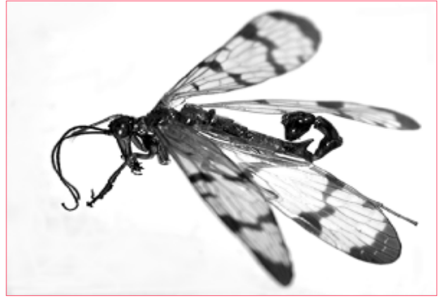
Panorpa helena Byers (family Panorpidae)