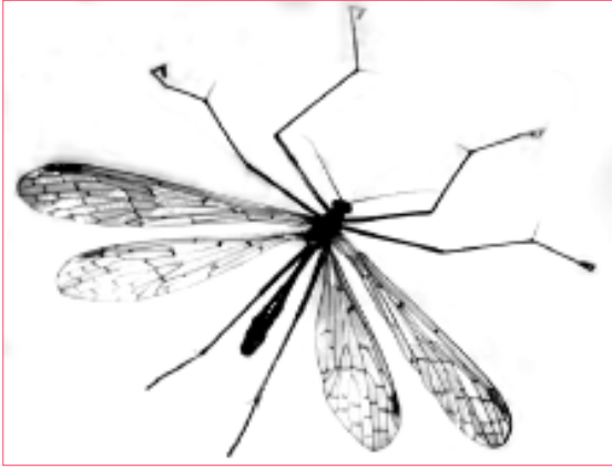
Bittacus pilicornis Westwood (family Bittacidae)