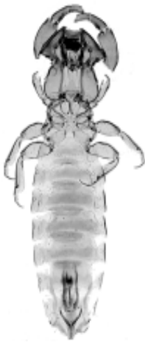
Trichalipeurus ilipeuroides (male), a chewing louse that parasitizes white-tailed deer.