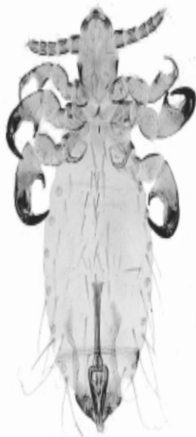
Solenopotes binipilosus (male), a sucking louse that parasitizes white-tailed deer.

It is probably safe to assume that most of us who have enjoyed fieldwork or hiking in the Smoky Mountains also have unintentionally provided bloodmeals to ectoparasites during these activities. Except in unusual cases, the ectoparasites in this area that opportunistically feed on humans are common, widespread species such as the American dog tick, the lone star tick, and one or two species of chiggers. Humans may find these ectoparasites annoying, particularly given the fact that some of them can transmit pathogens such as the causative agent of Rocky Mountain spotted fever. However, most of the ectoparasite species that parasitize vertebrates in the Smoky Mountains are associated with native mammals and birds, with lesser diversity on reptiles and amphibians. Far from being solely a cause of pathology or an inconvenience to their hosts, parasites are now recognized as integral components of healthy ecosystems. They can drive host evolution to promote community biodiversity and increase genetic diversity in host populations.