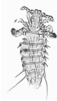
Microphthirus uncinatus (female), the world's smallest species of louse, is an ectoparasite of flying squirrels ( Glaucomys spp.).