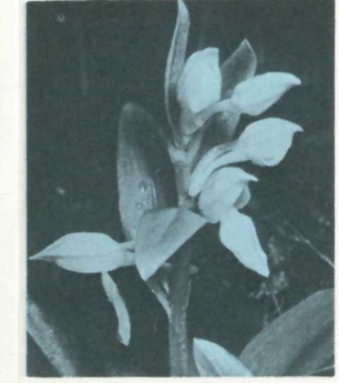
Large Flowered Trillium