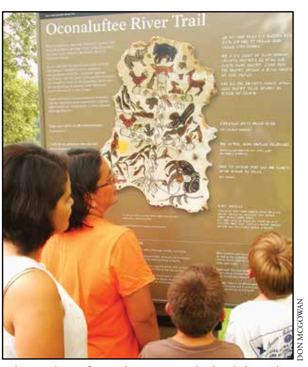
Hikers read one of seven decorative panels placed alongside the park's Oconaluftee River Trail that tell traditional Cherokee stories in both English and Cherokee. The National Park Service and Eastern Band work cooperatively on a number of education and historic preservation programs.

Yet the Eastern Band's determination to save its language is bearing fruit. Funded in part by proceeds from Harrah's Casino in Cherokee, the Kituwah Preservation and Education Program is providing language learning opportunities and teaching materials for children as young as six months. Participating pre-schoolers and some primary school students are immersed in the Cherokee language for