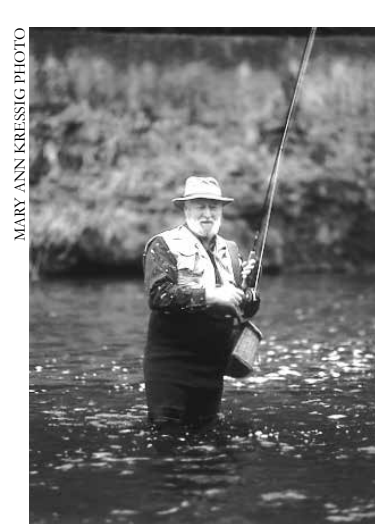
Fishing for brook trout is now allowed in most park streams. fishing

The park service operates horse camps at Cades Cove, Big Creek, Cataloochee, and Round Bottom. Call 877-444-6777 or visit www.Recreation. gov for reservations.