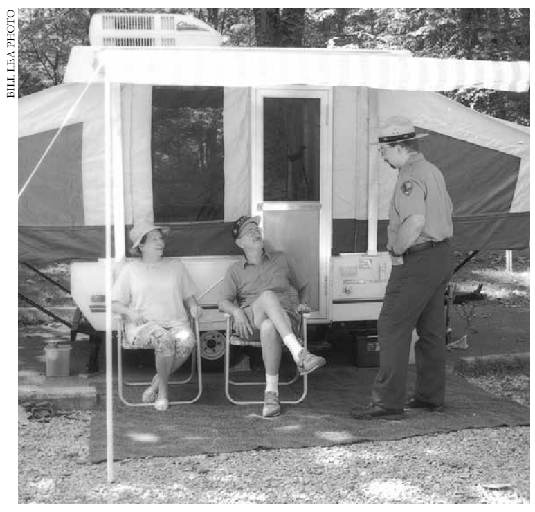
Abrams Creek and Balsam Mountain campgrounds are open this year. camping in the national park

The National Park Service maintains developed campgrounds at nine locations in the park. There are no showers or hookups other than circuits for special medical uses at Cades Cove, Elkmont, and Smokemont.