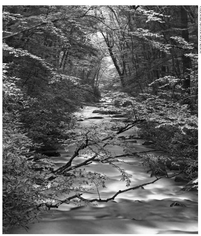
Much of the national park is currently managed as wilderness even though it has not been officially designated as such.

hroughout 2014, Great ▲ Smoky Mountains National Park is joining with other public lands agencies and organizations to celebrate the 50th anniversary of the passage of the Wilderness Act, one of the most important pieces of conservation legislation ever signed into law.