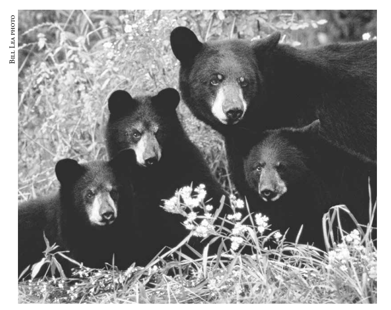
The many yearling bears in the park this summer were born in the winter of 2012-13. Most will separate from "mom" by late June.

*from the "Leopold Report," (Wildlife Management in National Parks) 1963.