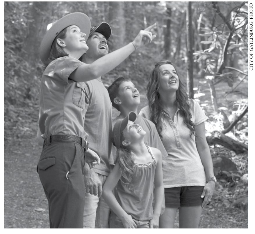
Programs will be held throughout the park this summer.