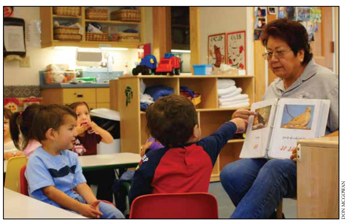
Teaching students to read Cherokee at the Tribal Child Care Center

The Cherokee Indian Reservation is one of the park's neighbors to the south.