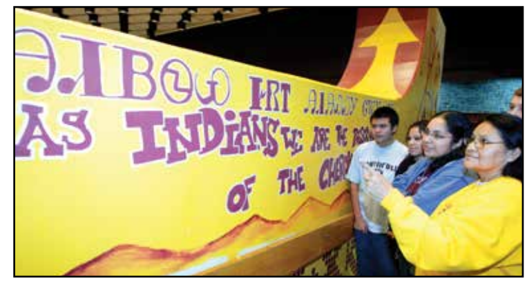
A staircase mural at Cherokee Central School System reads, in both Cherokee and English, "As Indians we are the preservers of the Cherokee."

If you would like to learn a bit more about the Cherokee language, the Oconaluftee River Trail between Oconaluftee Visitor Center and the town of Cherokee is a great place to begin. The 1.6-mile-long trail features colorful exhibit panels in both Cherokee and English that relate stories of the Cherokee's ongoing relationship to the mountains.