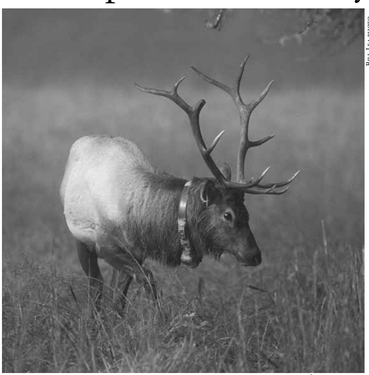
The park's elk herd has grown from 52 to over 150 since 2002.

Part of the responsibility that rangers assume when they wear the flat hat and the arrowhead logo is to strive to preserve the wildland portions of the Great Smoky Mountains in a natural condition. One long-standing park management document aptly describes this goal as: "A national park should present a vignette of primitive America."*