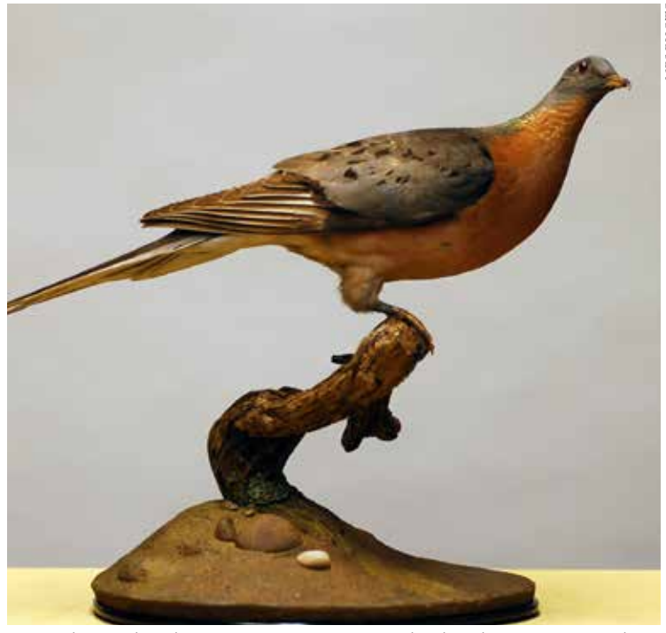
A taxidermied male passenger pigeon is on display this summer at the Sugarlands Visitor Center museum. The specimen dates back to 1856.