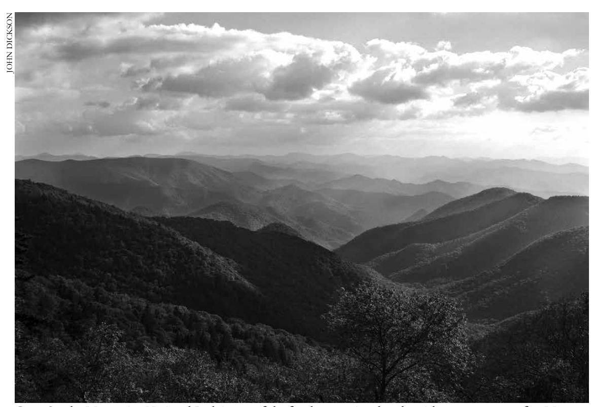
Great Smoky Mountains National Park is one of the few large national parks without an entrance fee. Most parks now charge $20 or $25 per vehicle. Without this supplemental income, it is difficult for the Smokies to adequately protect wildlife, preserve historic areas, and provide educational opportunities. You can help by using some of the money you saved at the entrance to support the park partners on this page.

Join today using the coupon to the right or visit www. SmokiesInformation.org, or call us at 1-888-898-9102 x222. Memberships start at just $35.