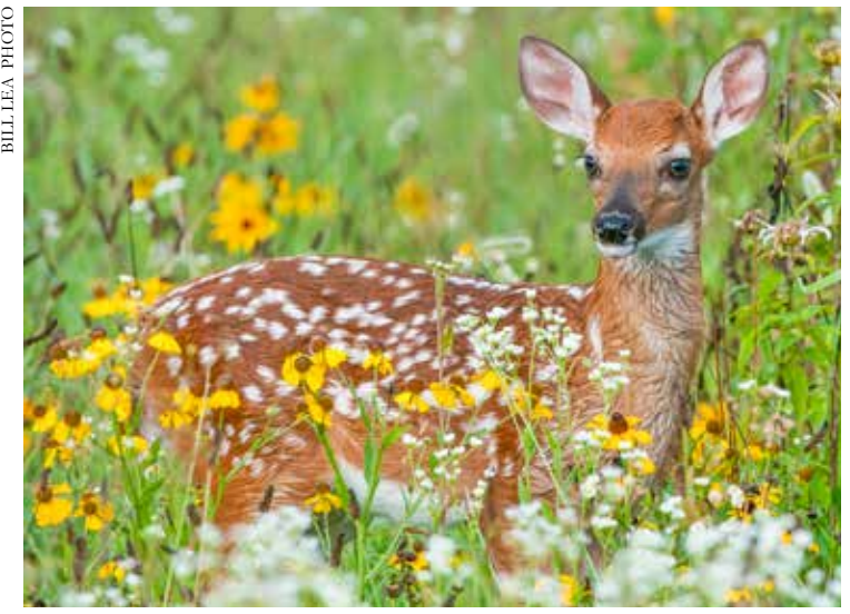
The areas in Cades Cove that have been restored to natural meadows support native flowers, quail, deer, and other flora and fauna.