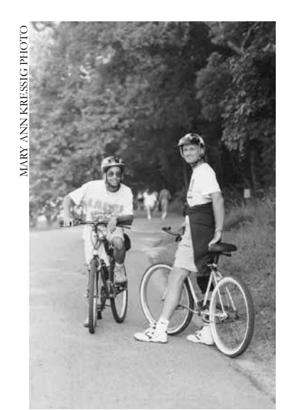
Bicycle morning in Cades Cove

For information on lodging outside the park: Bryson City 1-800-867-9246 Cherokee 1-800-438-1601 Fontana 1-800-849-2258 Gatlinburg 1-800-267-7088 Maggie Valley 1-800-624-4431 Pigeon Forge 1-800-251-9100 Sevierville 1-888-766-5948 Townsend 1-800-525-6834