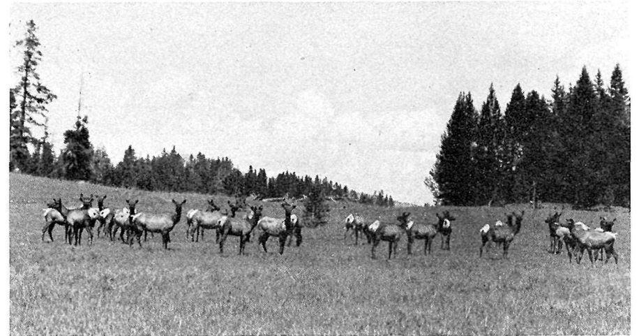
A part of the Jackson Hole Elk herd.

In several respects the flora of the Teton is unique. The high mountains