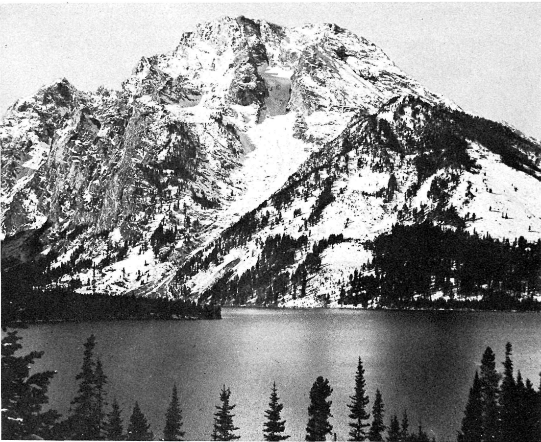
View of Mount Moran from the east shore of Leigh Lake.

mail, and express service to Grand Teton National Park at an airport located about 9 miles north of Jackson, Wyo., and 8 miles south of park headquarters. Connections are made at Salt Lake City with United Air Lines main transcontinental line, and at Butte, Helena, and Great Falls, Mont., with Northwest Airlines.