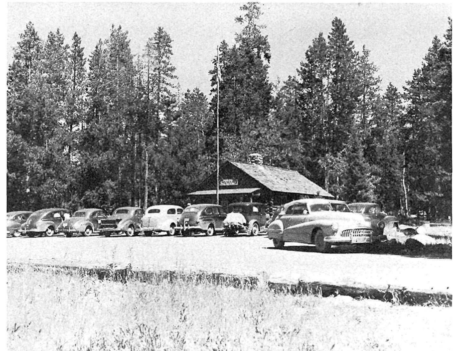
The Jenny Lake Museum—Public Information Center.

Persons inexperienced in mountain climbing are requested to obtain the services of a mountain-climbing guide,