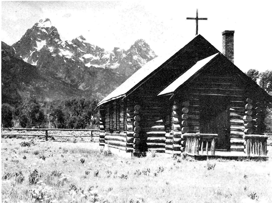
Church of the Transfiguration at Moose.