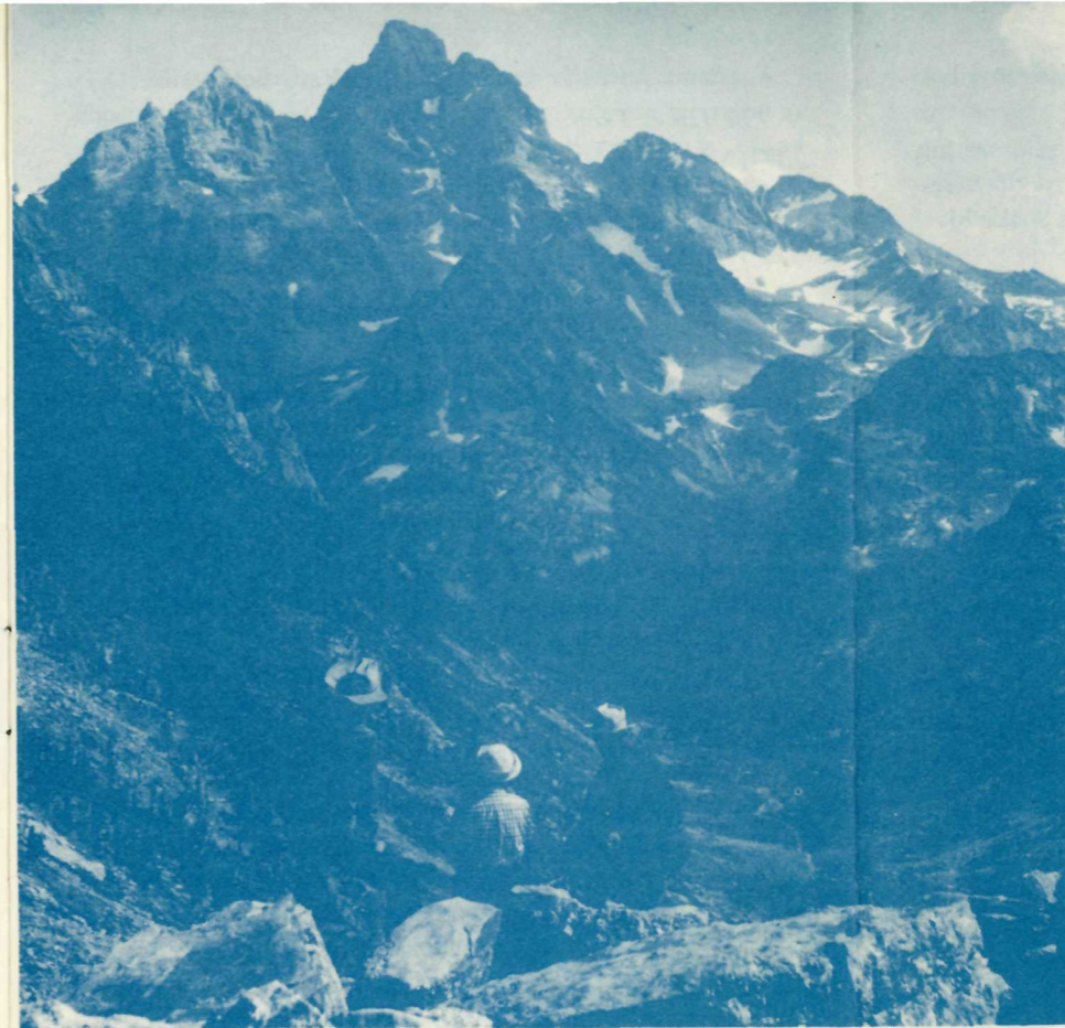
Hikers near Lake Solitude. West slope of Grand Teton in the background.

Guided Trips. There is a choice for every interest, every age, and every degree of physical ability. On any day, for example, you may join an auto caravan to major points of interest, or go on a short, leisurely nature walk, or join a naturalist-conducted hike to Hidden Falls, Phelps Lake, or other points of interest.