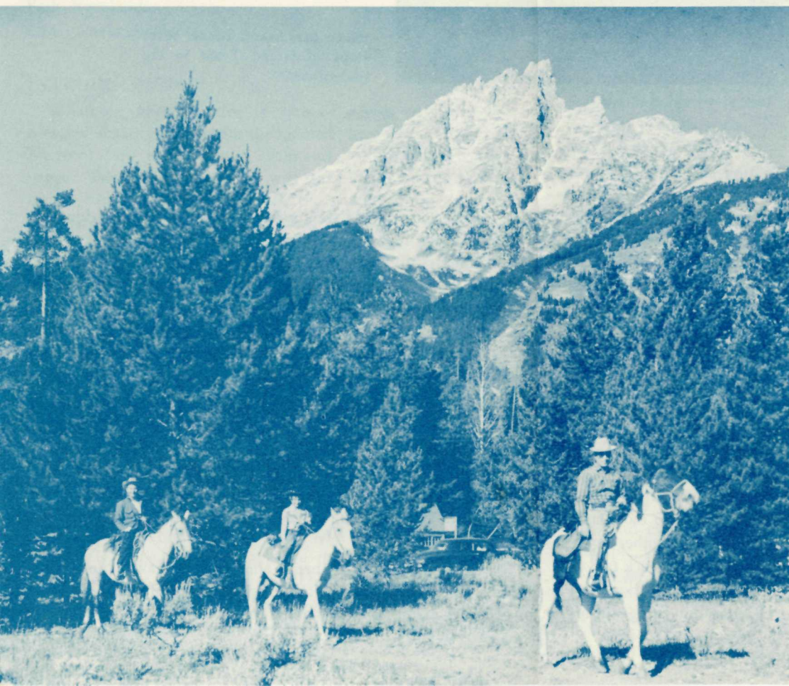
Riders starting on a trip around Jenny Lake.

Two-day trips are required also for Mounts Owen and Moran. Other peaks can be climbed in a single day.