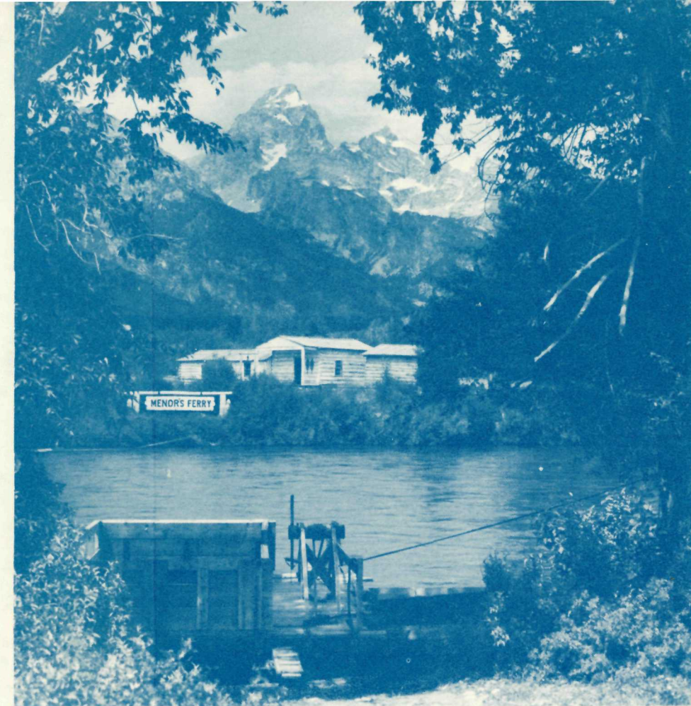
Historic Menor's Ferry at Moose.

developed. Two old homesteads have been restored as historic buildings—the Noble cabin and Menor's Ferry holdings at Moose, and the Cunningham place on the east side. The latter is the site of a famous feud between a Jackson Hole sheriff's posse and horsethieves who shot it out from the cabin's low windows in 1892.