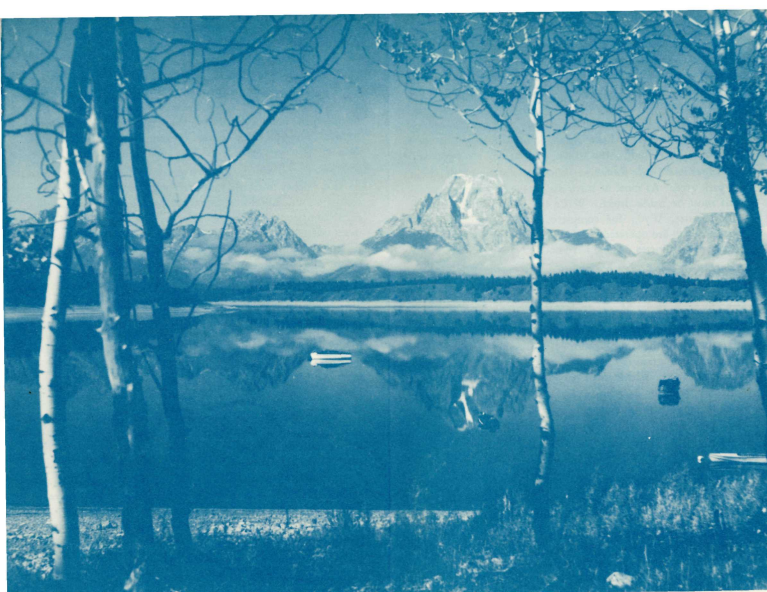
Mt. Moran reflected in Jackson Lake.

Camping or parking cars overnight along roadsides, or at other undesignated spots, is not permitted. Camps must be kept clean, rubbish and garbage burned, and refuse placed in cans provided for this purpose.