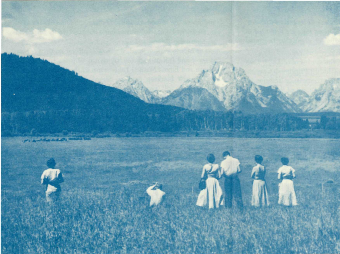
Snapping photos of wildlife and scenery.

A fine little book entitled "Yellowstone and Grand Teton's Wild Flowers" is available at the park visitor centers and elsewhere for $1. This well-illustrated guide gives suggestions for flower photography as well. Picture turnouts along the roads have photographic exhibits of the mountains to help you identify what you are shooting. (The peaks look entirely different as you move about in the park, and it is not always easy to identify them.)