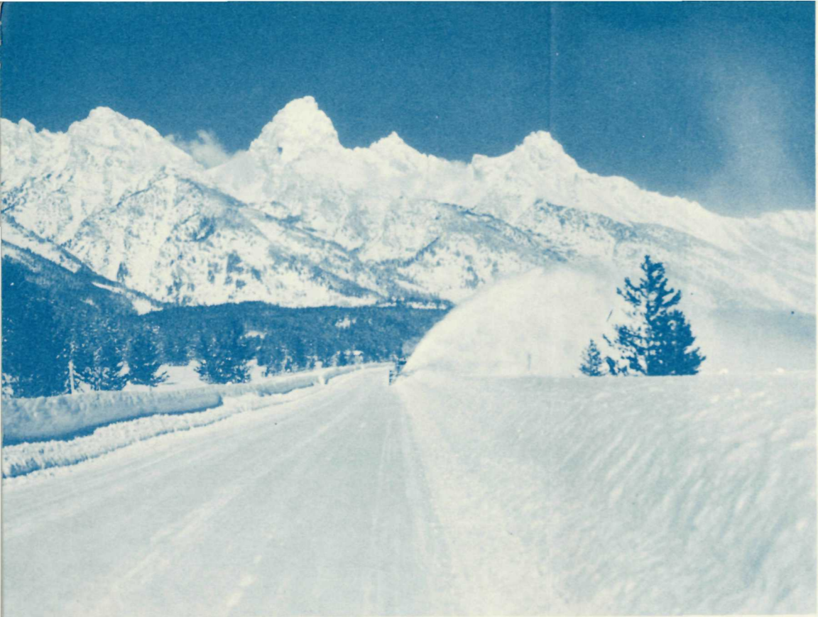
Winter in the Tetons.

dresses, shirts, and shorts comfortable during the day; but a wrap is always needed in the evening.