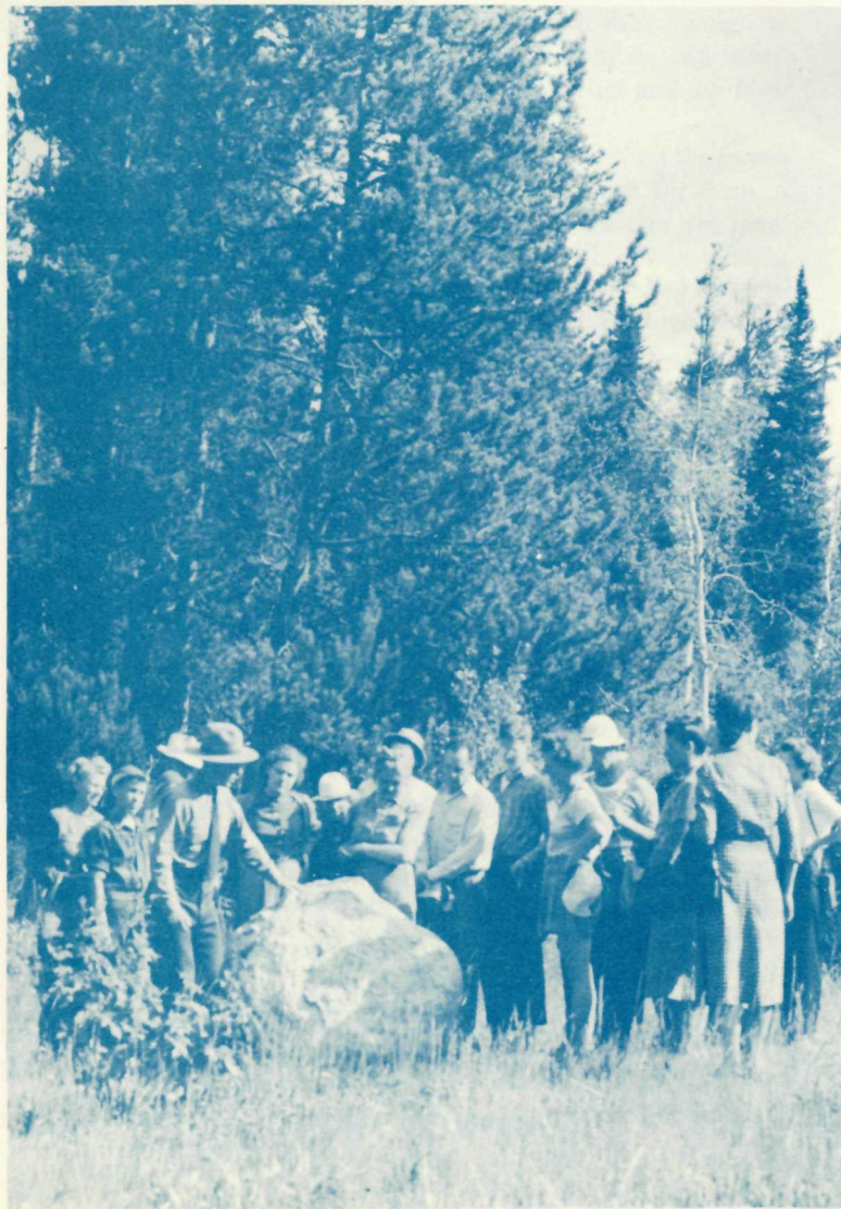
Ranger naturalist with group near Jenny Lake Museum.

In 1884 the first settlers began to put down roots in this mountain valley, and the villages of Jackson and Wilson (just outside the park) and, later, Moran (near Jackson Lake) were