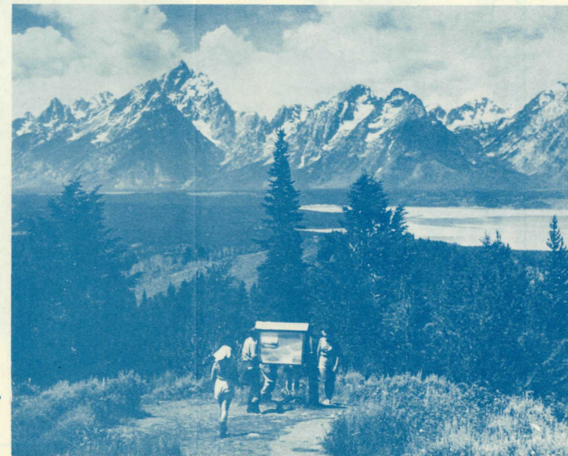
Roadside exhibit atop Signal Mountain.

Photographic concessioners at Jenny Lake and Jackson Lake Lodge have ample supplies of film on hand and will help you with any special photographic problem.