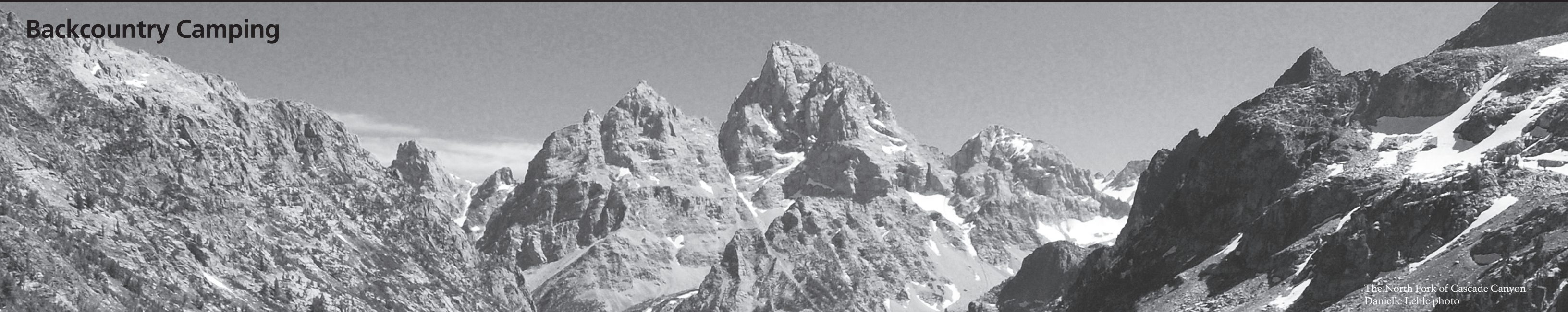
The North Fork of Cascade Canyon Danielle Lehle photo