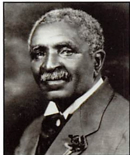
George Washington Carver at Tuskegee Institute, Alabama

George Washington Carver National Monument is the birthplace and childhood home of the famed scientist, educator and humanitarian. Established in 1943, it is the first unit of the National Park Service dedicated to an African American.