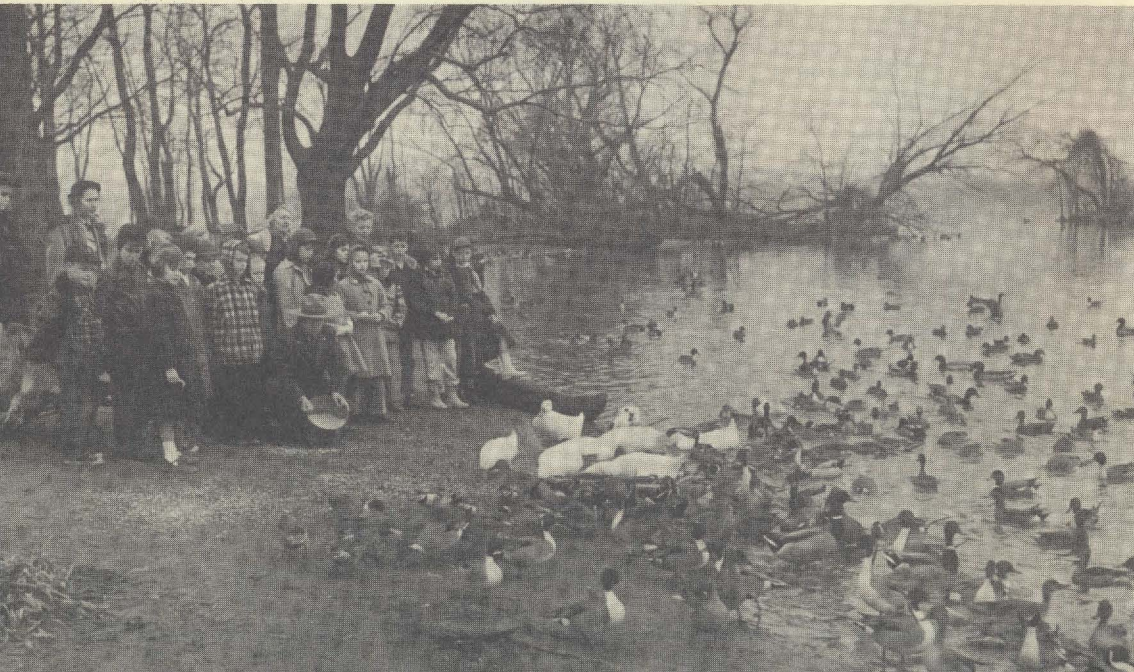
Wintering ducks are fed at Roaches Run Waterfowl Sanctuary

independence and foundation under the Constitution, visited here.