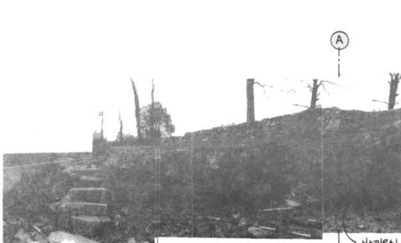
1/12 FOUNDRY SITE - SOUTH ELEVATION