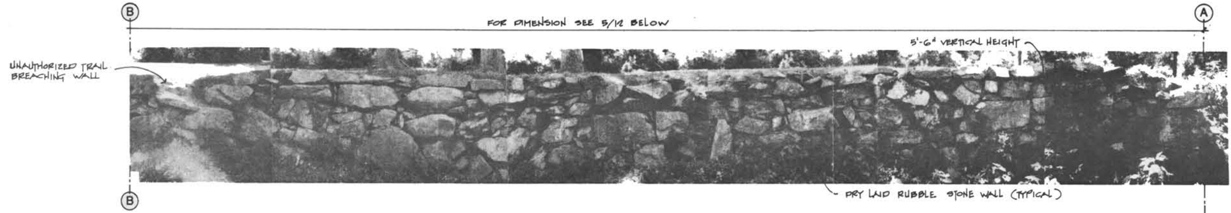
4/12 RIVER WALL - SOUTH OF FOUNDRY