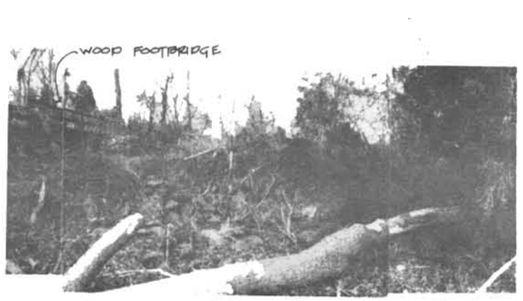
3/12 FOUNDRY SITE - NORTH ELEVATION