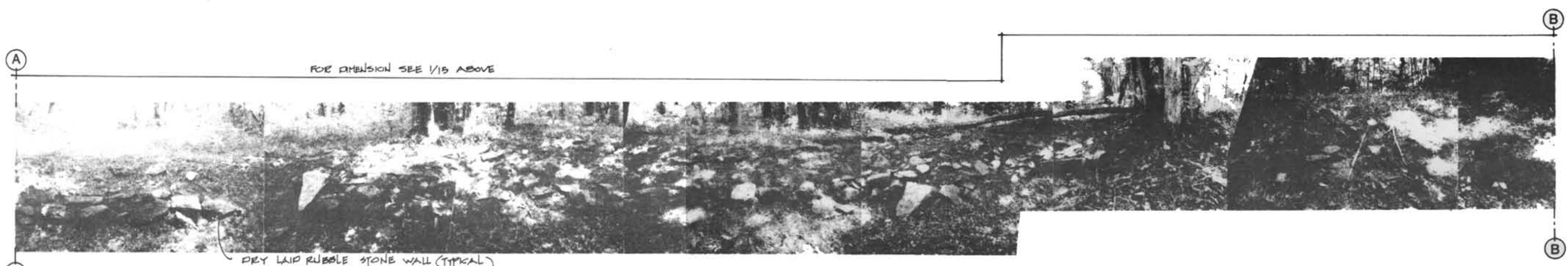
2 15 RIVER WALL - SOUTH OF HEAD GATE