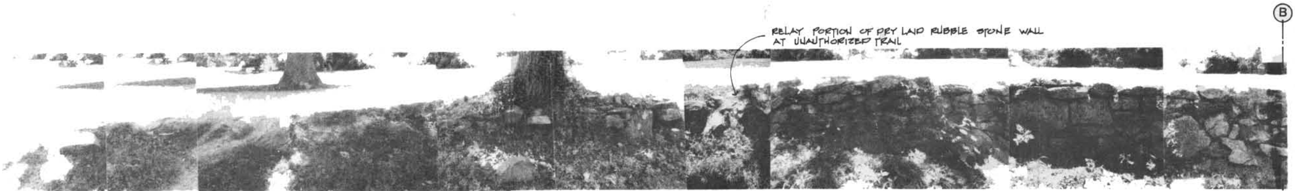
5 25 RIVER WALL - SOUTH OF FOUNDRY (PRIORITY 2A)