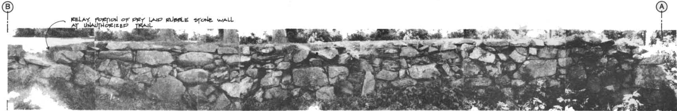
4 25 RIVER WALL - SOUTH OF FOUNDRY (PRIORITY 2A)