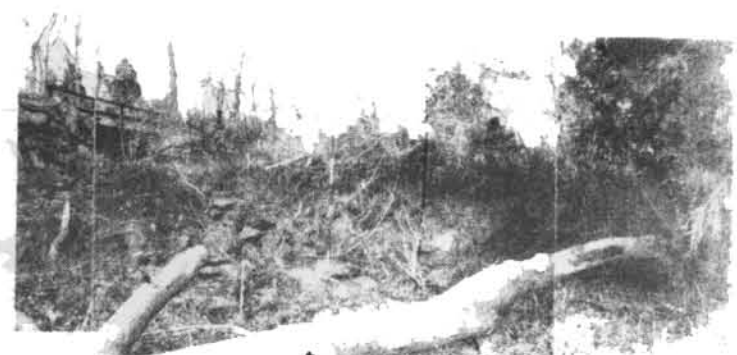
3 25 FOUNDRY SITE - NORTH ELEVATION (PRIORITY 2A)