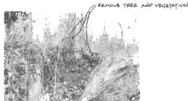
4 27 CONTROL GATE AT LOWER HOLDING BASIN ( EAST OF LOCK 2 ) VIEW LOOKING NORTHWEST 169 (PRIORITY 2C)