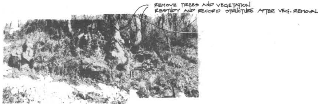
2 27 CONTROL GATE AT SOUTHWEST CORNER OF HOLDING BASIN ( EAST ELEVATION ) (PRIORITY 2C)