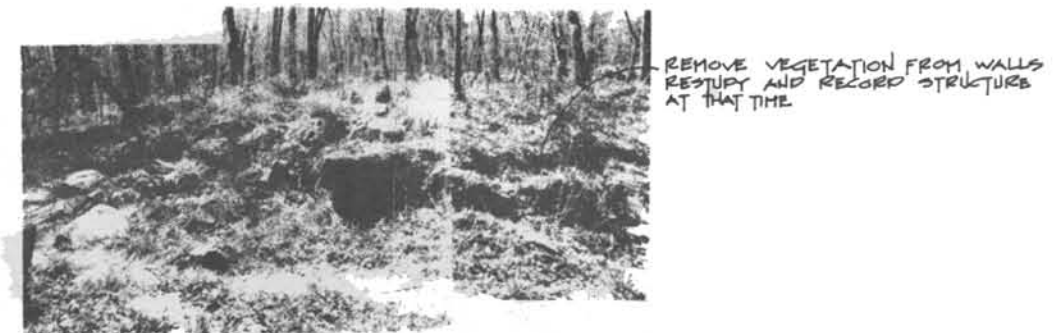
3 27 CONTROL GATE AT SOUTHWEST CORNER OF HOLDING BASIN ( WEST ELEVATION ) (PRIORITY 2C)