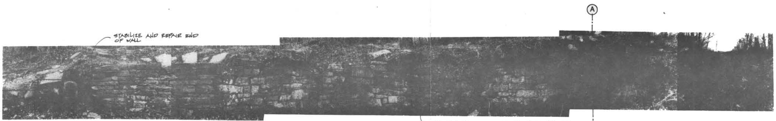
2 LOCK 3 - BERM WALL AT SOUTH END 34 (PRIORITY 1C)