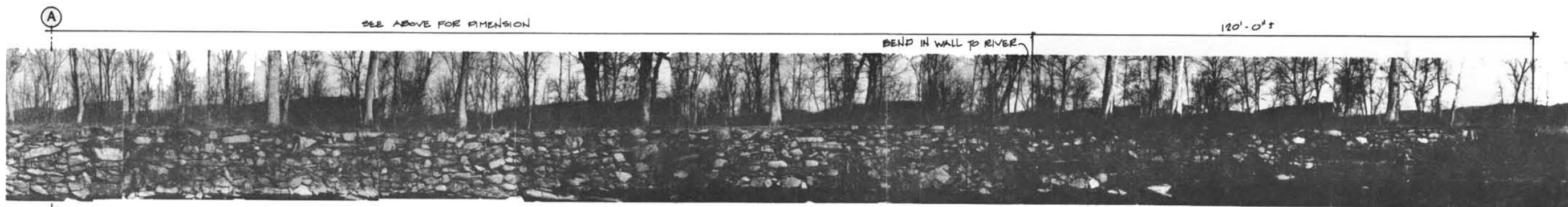
2/4 RIVER WALL OF CANAL BELOW UPPER GUARD GATE