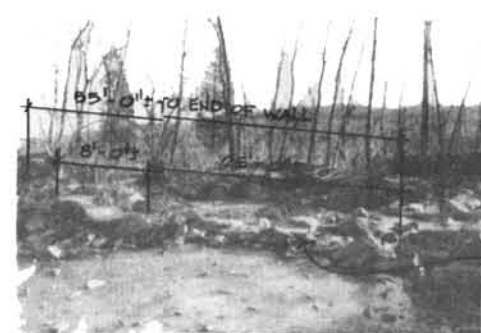
4/4 LOWER SPILLWAY