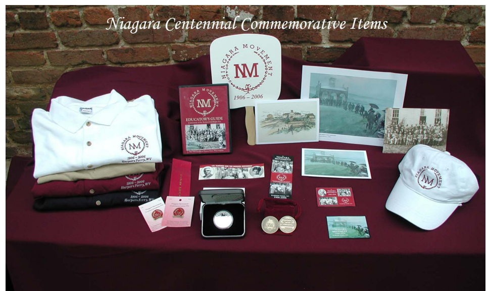
A variety of books, music, and art will be available at the Harpers Ferry Historical Association Sales Tent on the Mather Lawn.

Closing Ceremony - Presentation of Niagara Centennial Plaque followed by gathering for centennial photograph on Mather Lawn