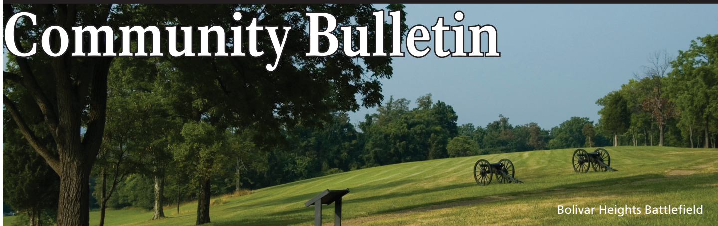
Bolivar Heights Battlefield